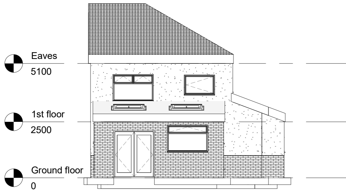
4 Rear 1 : 100