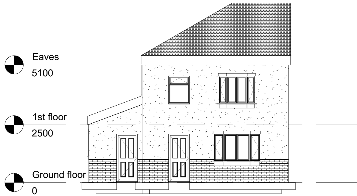
1 Front 1 : 100