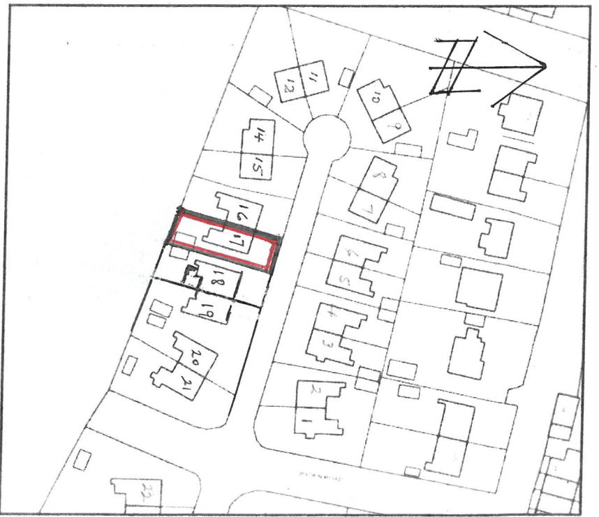
LOCATION PLAN 1/1250