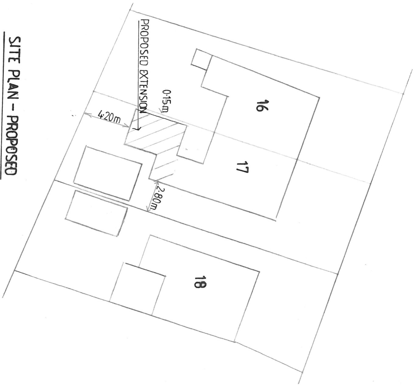
SITE PLAN – PROPOSED SCALE 1:200