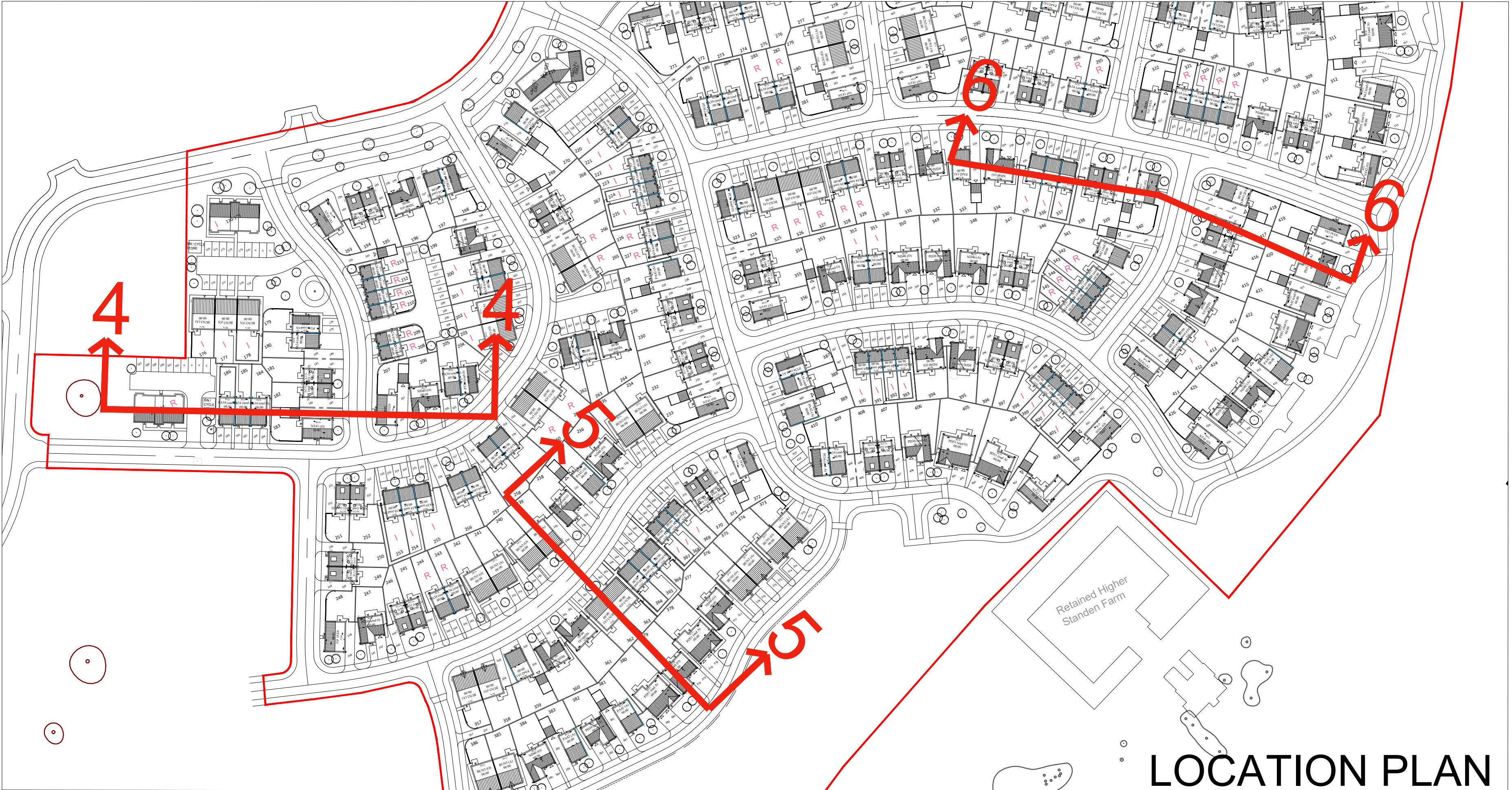
LOCATION PLAN NTS