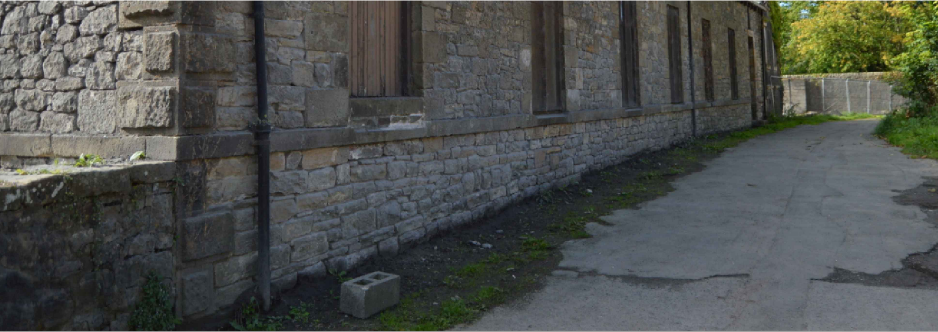
SOUTH WEST IMAGE OF ACCESS ROAD