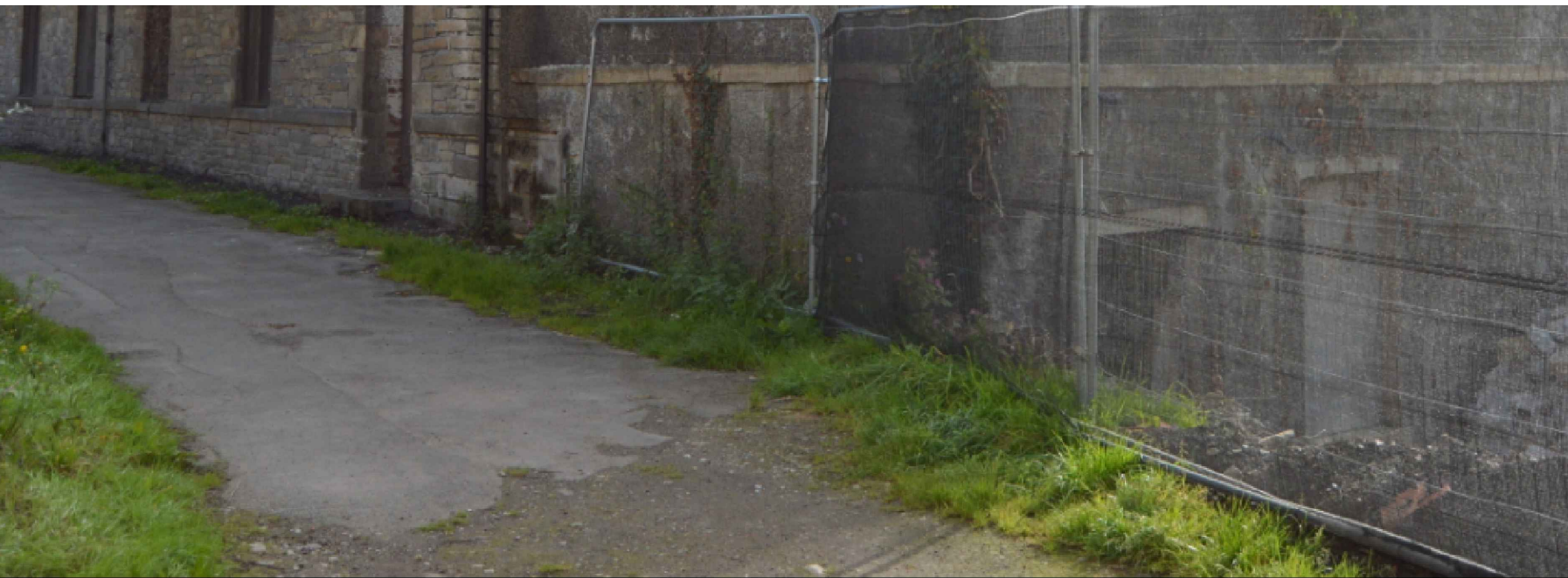
NORTH EAST IMAGE OF ACCESS ROAD

All Tarmac to comply with BS 4987. Clear access road of debris and rubble on completion and make good. Supply, lay and compact 70mm of 20mm dense base course bitmac, and 30mm of 6mm hardstone bitmac wearing course to falls and levels. Supply, lay and compact minimum of 225mm of DTp1 crushed stone sub-base material to falls and levels. Excavate any soft spots in sub-grade as required and dispose. Excavate to reduced depth of at least 200mm below finished level and cart all spoil to licensed, off-site tip.