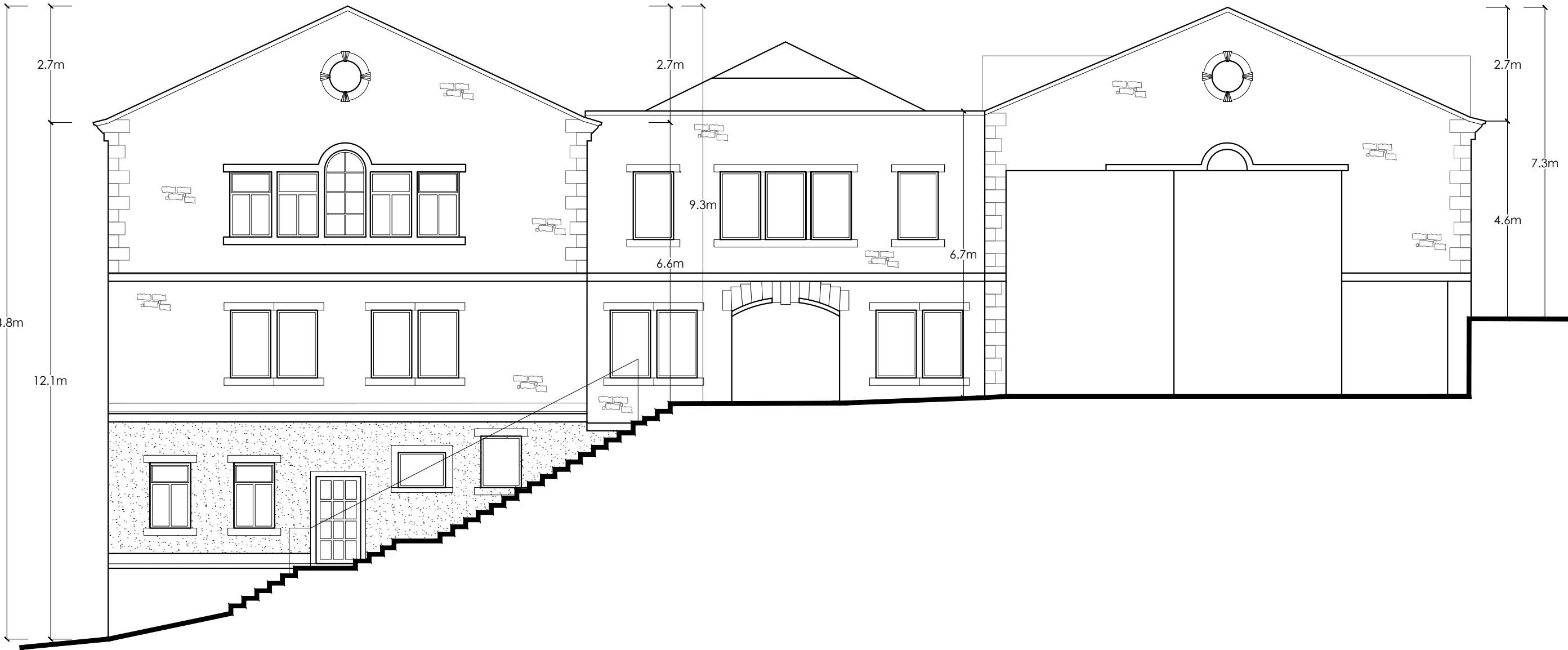
EXISTING EAST ELEVATION SCALE 1:100