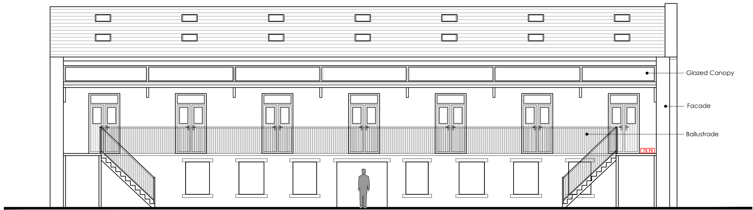
PROPOSED ELEVATION A SCALE 1:100