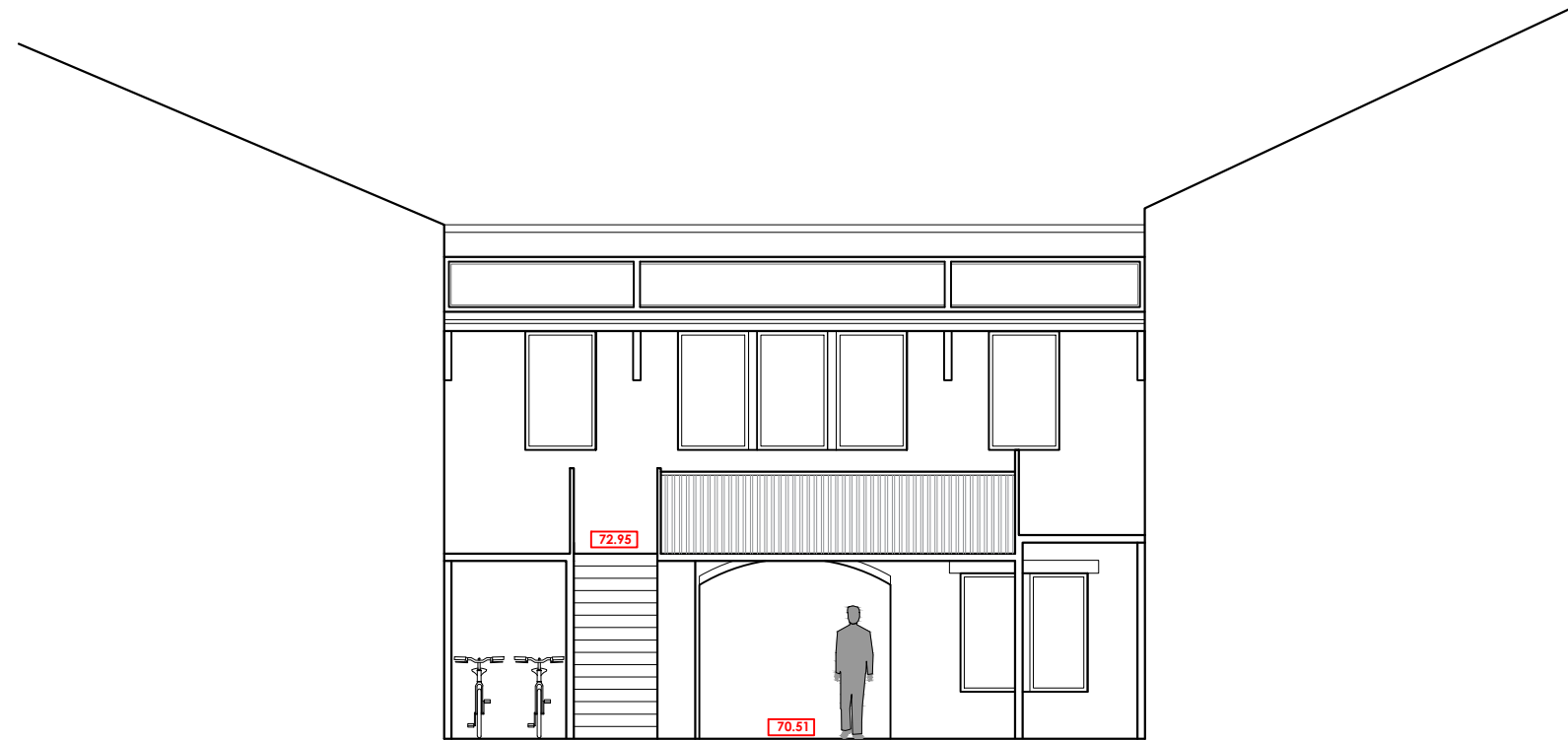
PROPOSED ELEVATION B SCALE 1:100