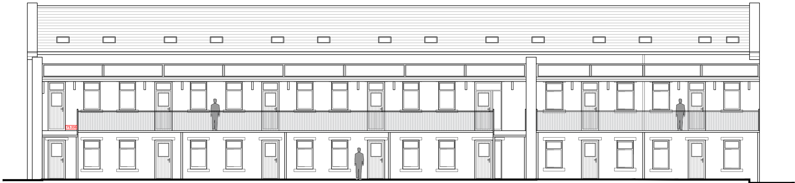
PROPOSED ELEVATION C SCALE 1:100