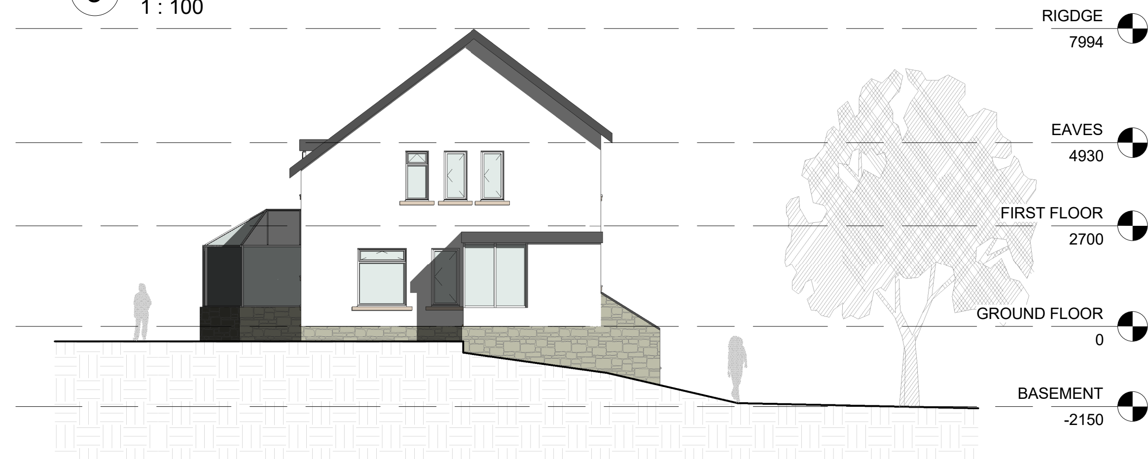
4 NORTH EAST 1 : 100