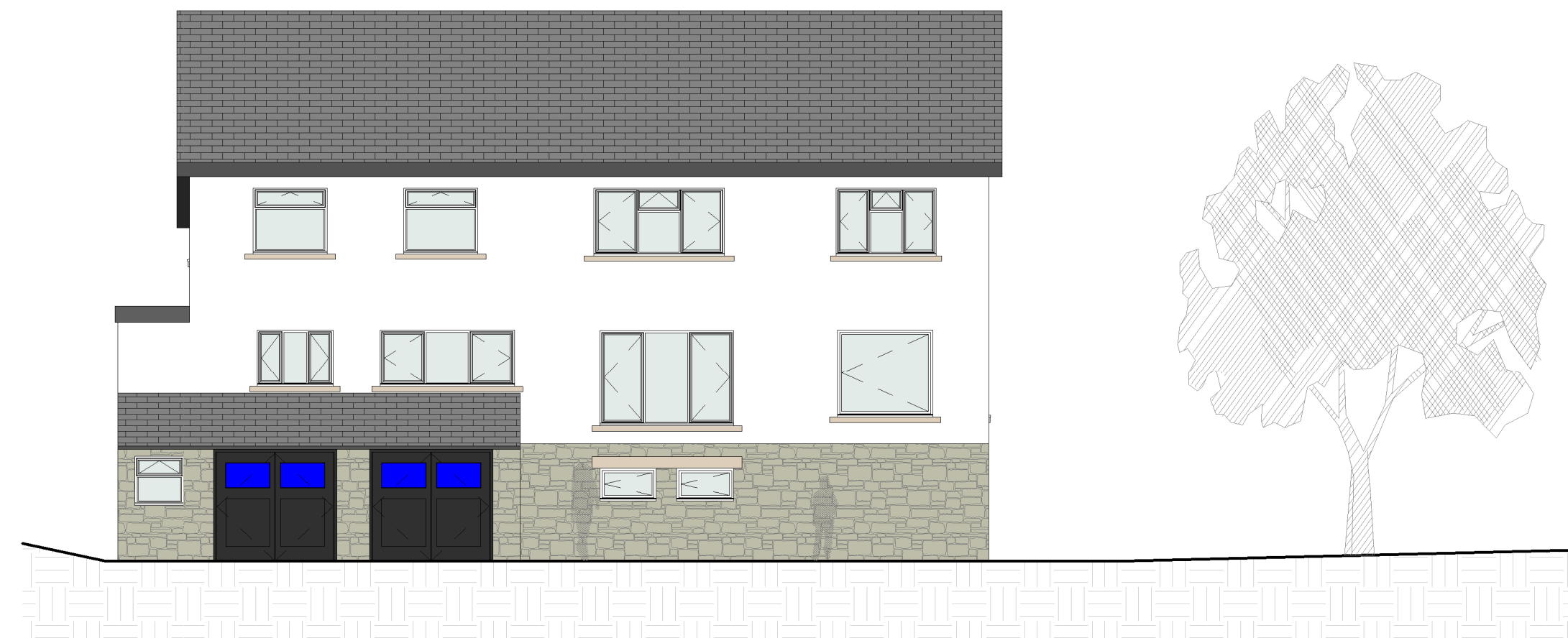
5 NORTH WEST 1 : 100