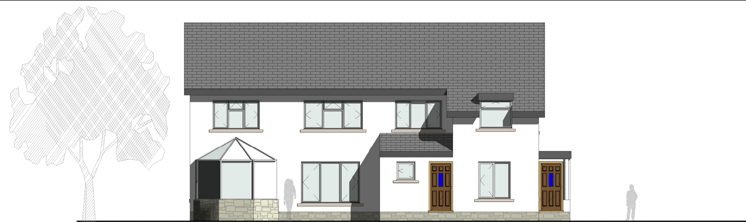
3 SOUTH EAST 1 : 100