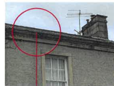
STONE GUTTER WITH LEAD LINING

EXISTING LEAD GUTTER LINING TO BE EXAMINED AND REPLACED AS NECESSARY USING CODE 5 LEAD