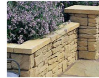
BOUNDARY TREATMENT Stone Wall