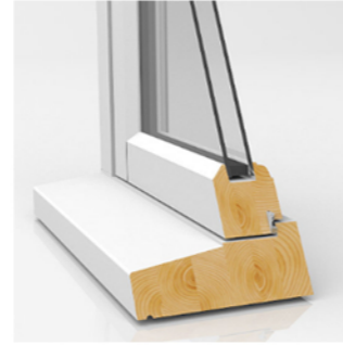
WINDOWS Timber Framed Double Glazed