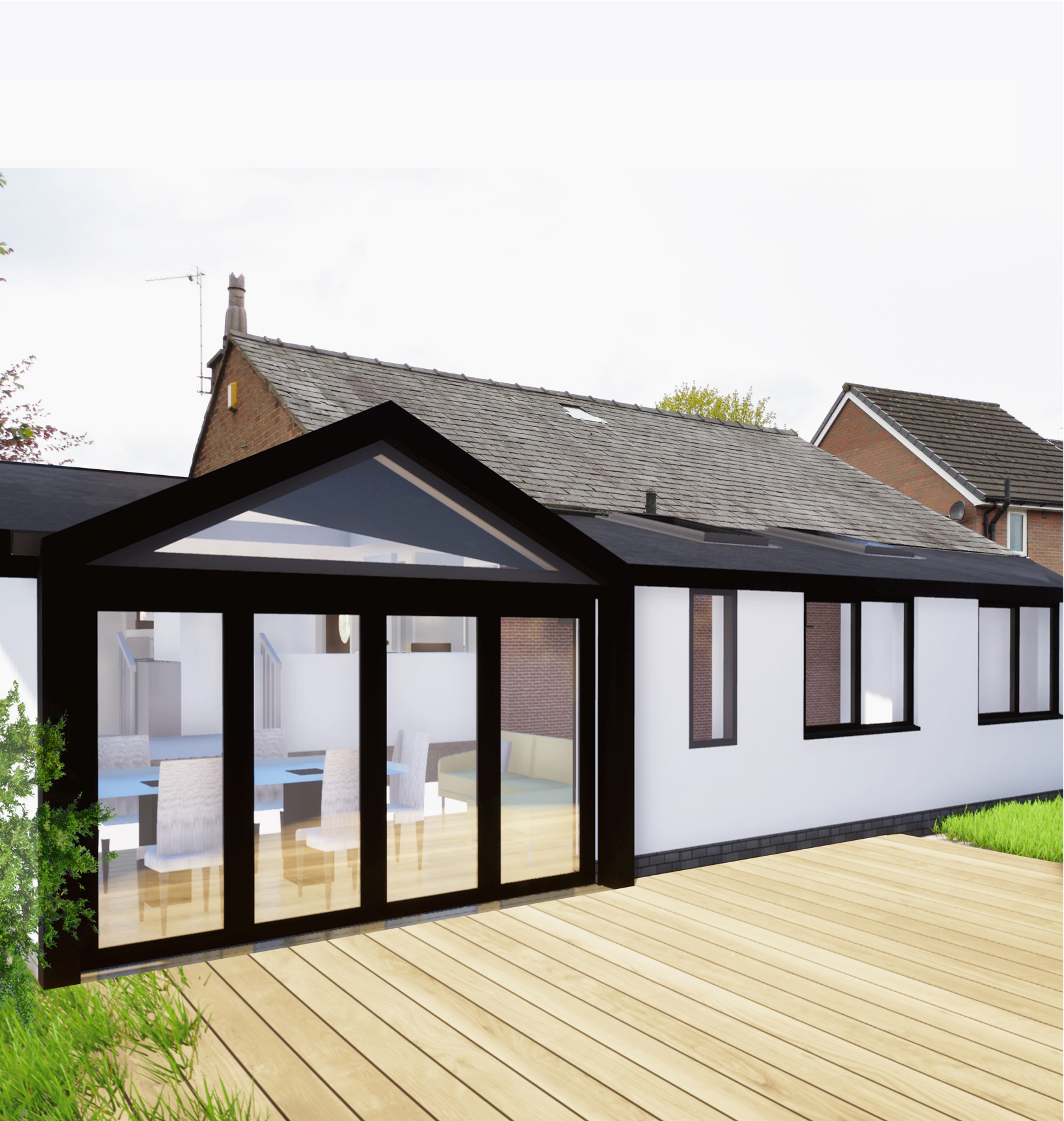
Proposed Rear Extention

DRAWING FOR INFORMATION PURPOSES ONLY This drawing and all its dimensions to be checked and verified by the contractor prior to work commencing on site. for clarification of queries contact studio John Bridge Ltd. (www.studiojohnbridge.co.uk) Contractor to ensure that all proposed materials are to Local Authority Approval. The Contractor shall take into account everything necessary for the proper execution of the works including all relevant Building Regulations, nhbc and British Standards where applicable, whether or not indicated on the drawings. please refer to structural and drainage designs to be prepared by others. Subject to services and statutory authority information & approval.