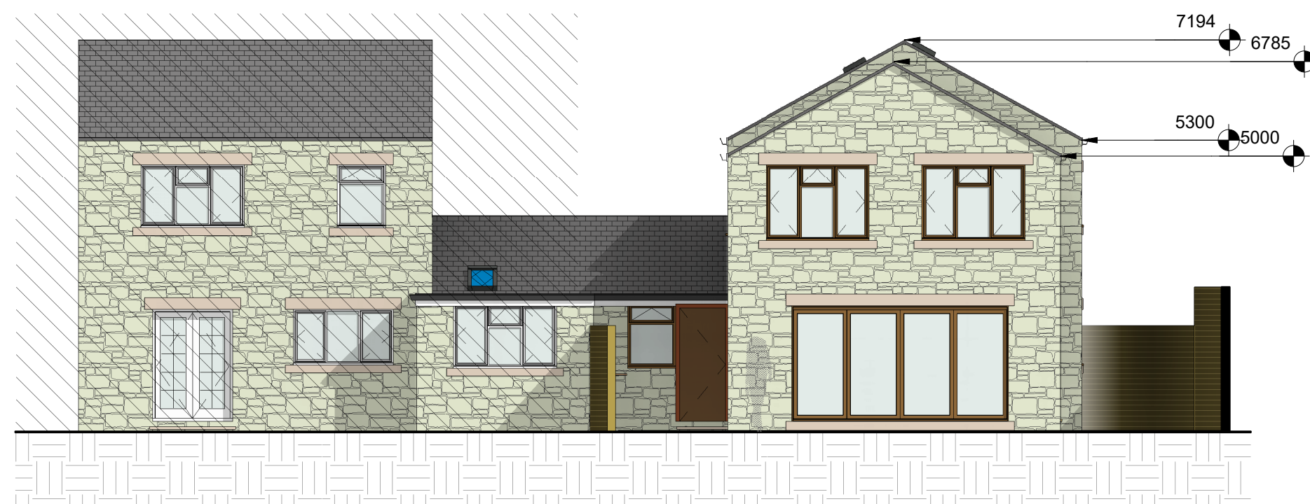
5 PROPOSED SOUTH EAST 1 : 100