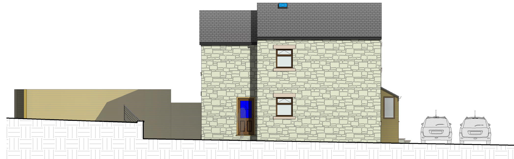
4 PROPOSED NORTH EAST 1 : 100