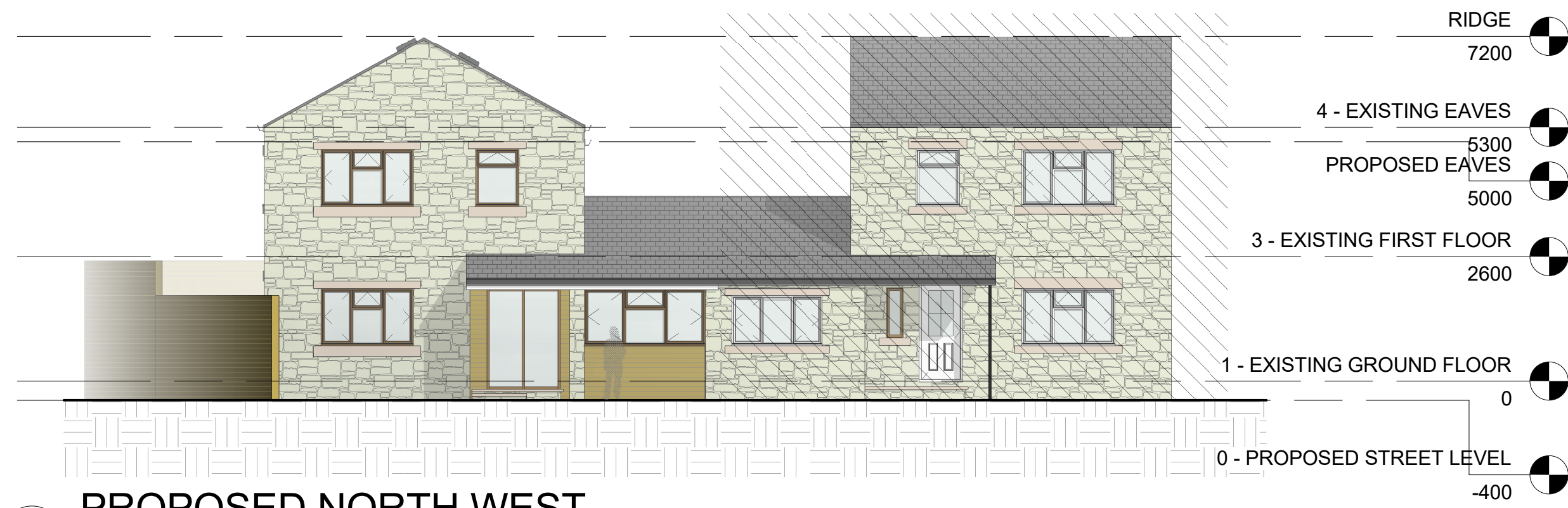
3 PROPOSED NORTH WEST 1 : 100