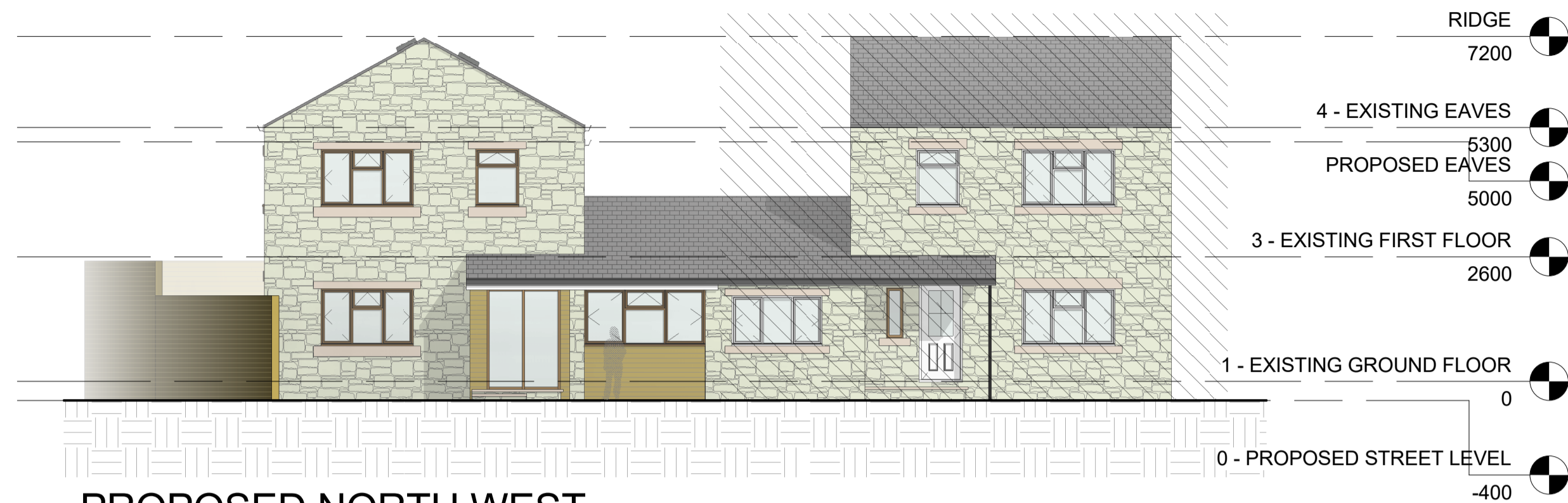
3 - PROPOSED NORTH WEST 1 : 100