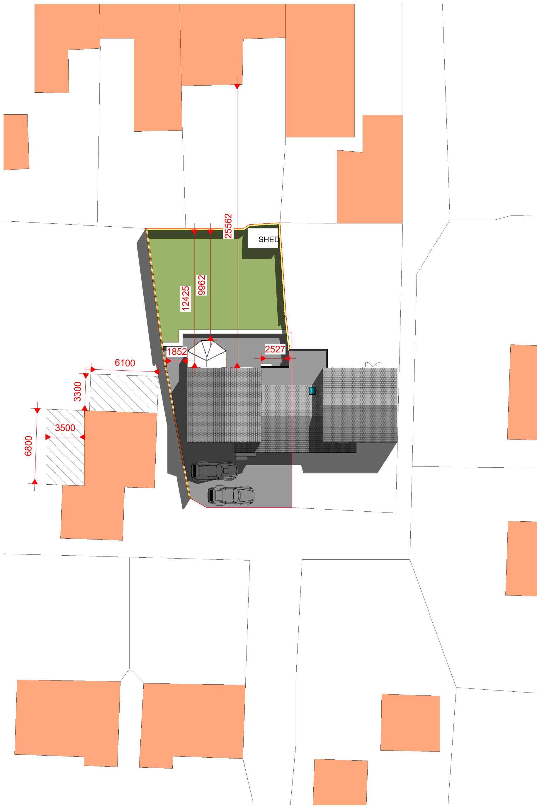
1 EXISTING SITE PLAN 1 : 200