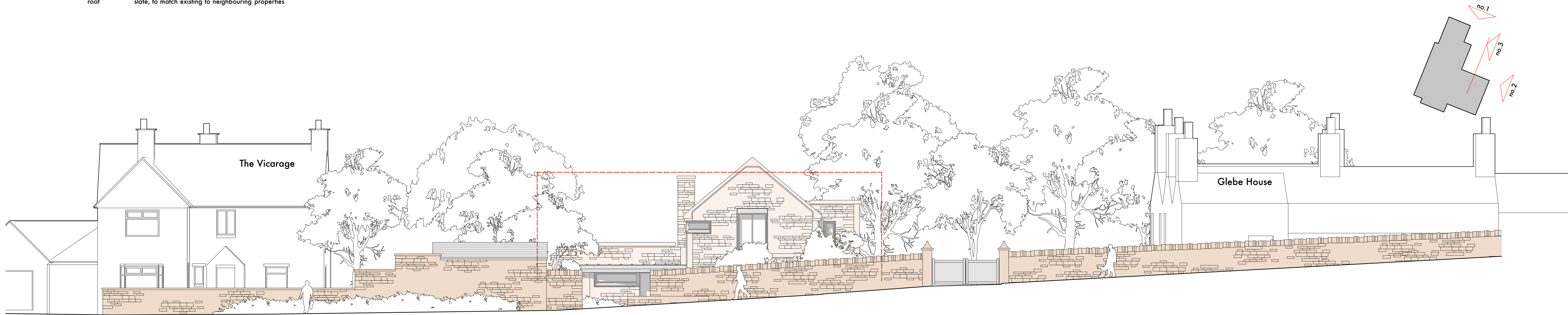
1 north elevation

this drawing is to be read in conjunction with all relevant consultants and specialists drawings. the architect is to be notified of any discrepancies before proceeding. do not scale from this drawing. all dimensions are to be checked on site. this drawing is subject to copyright.