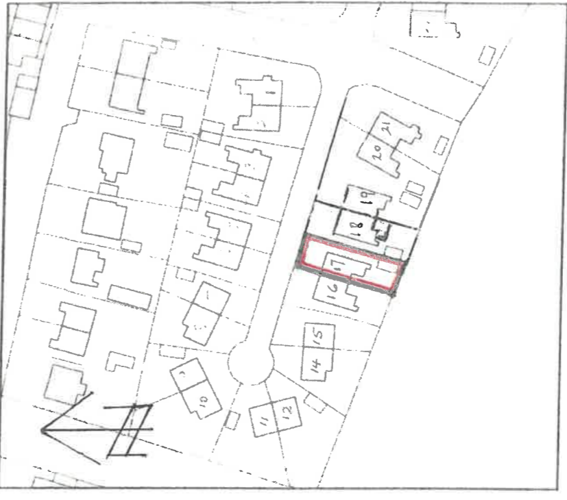
LOCATION PLAN 1/1250