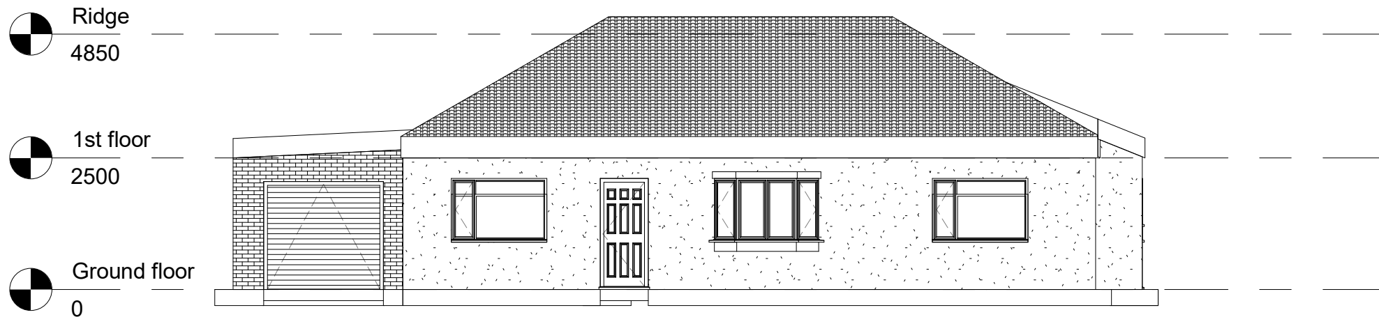
1 Front 1 : 100