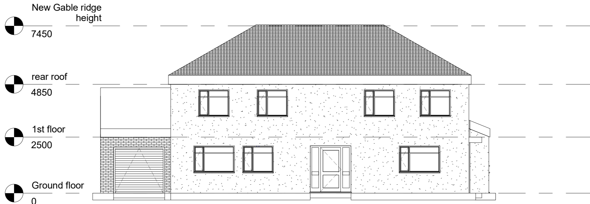
1 Front 1 : 100