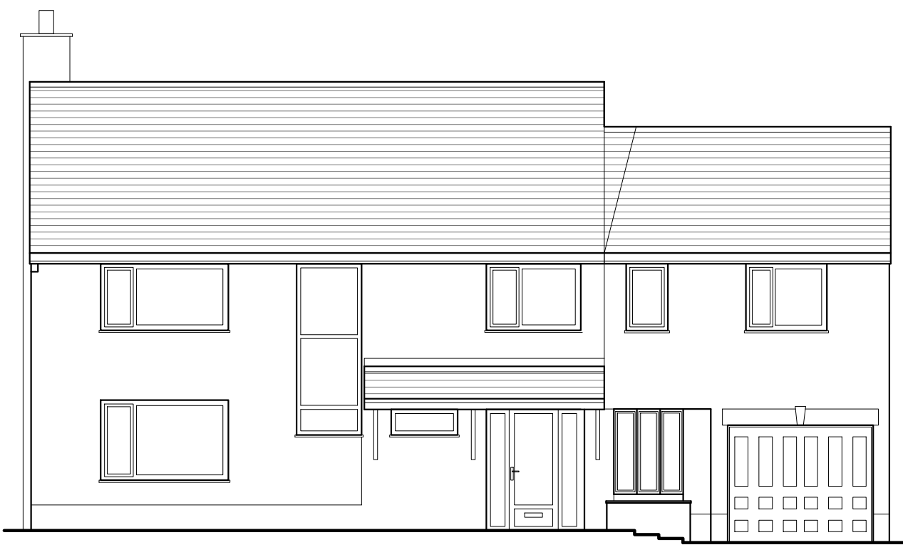
EXISTING WEST ELEVATION Scale 1:100