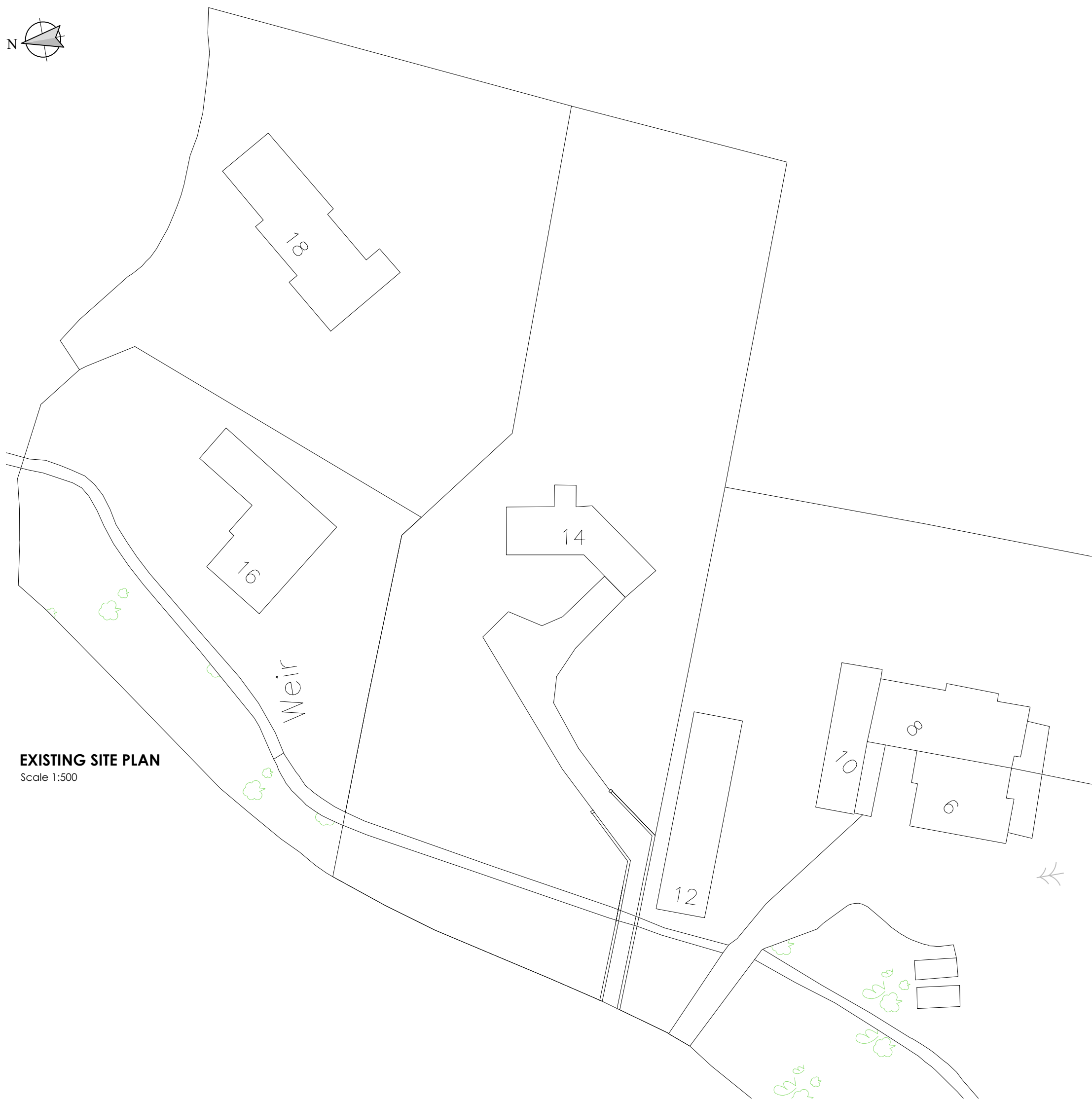
EXISTING SITE PLAN Scale 1:500