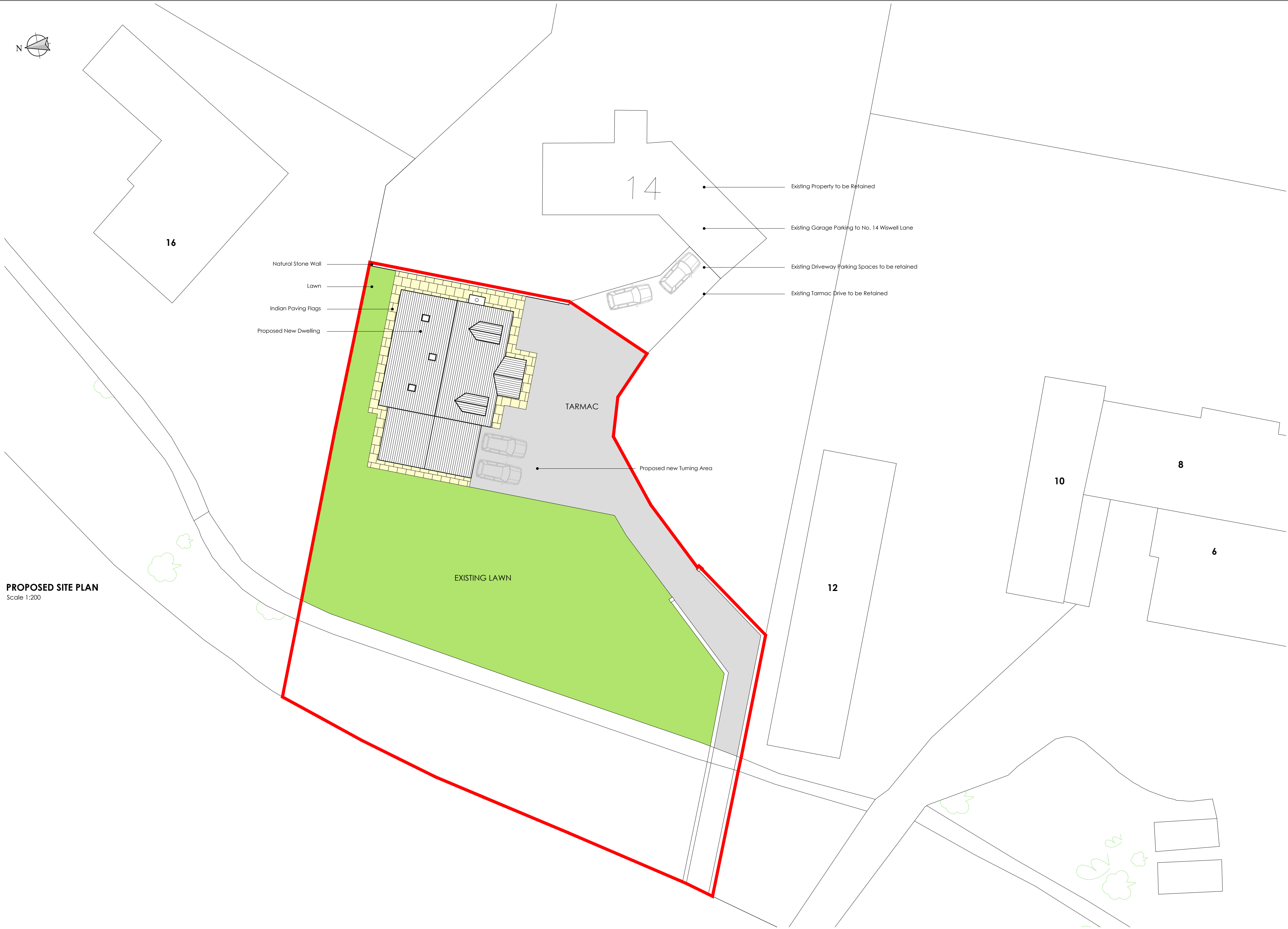
PROPOSED SITE PLAN Scale 1:200