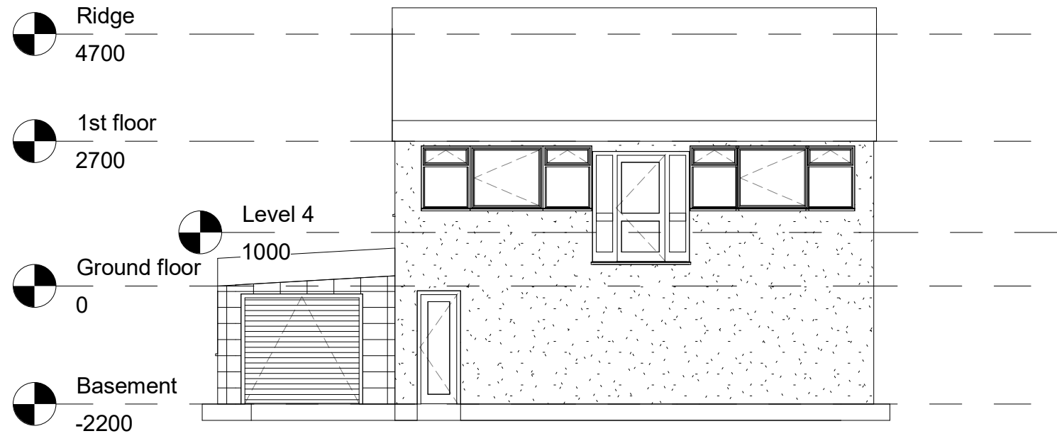
1 Front 1 : 100