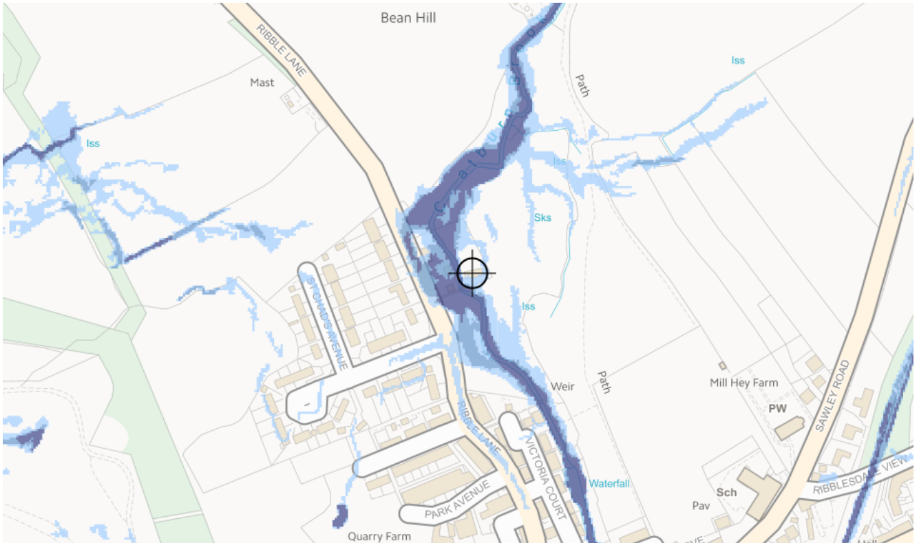
PL02: Flood Map showing risk of flooding resulting from surface water.

No groundworks or ground bearing structures are proposed as part of the development proposals. The development proposals involve the enlargement of an existing window opening to create small bi-fold doors out the rear of the property. The impact of flooding on the proposed use is irrelevant and will remain unchanged from the existing situation on the application site and the risk of flooding will not be made worse by the development proposals.