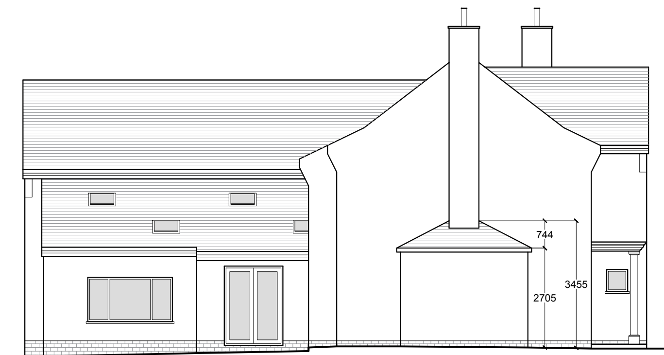
EXISTING NORTH WEST ELEVATION SCALE 1:100