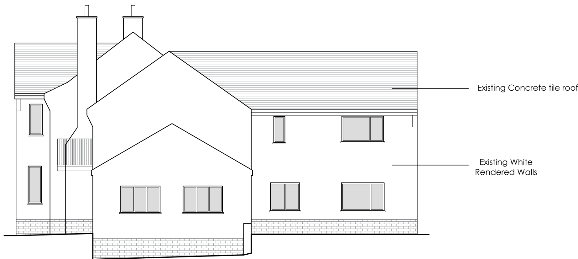
EXISTING SOUTH EAST ELEVATION SCALE 1:100