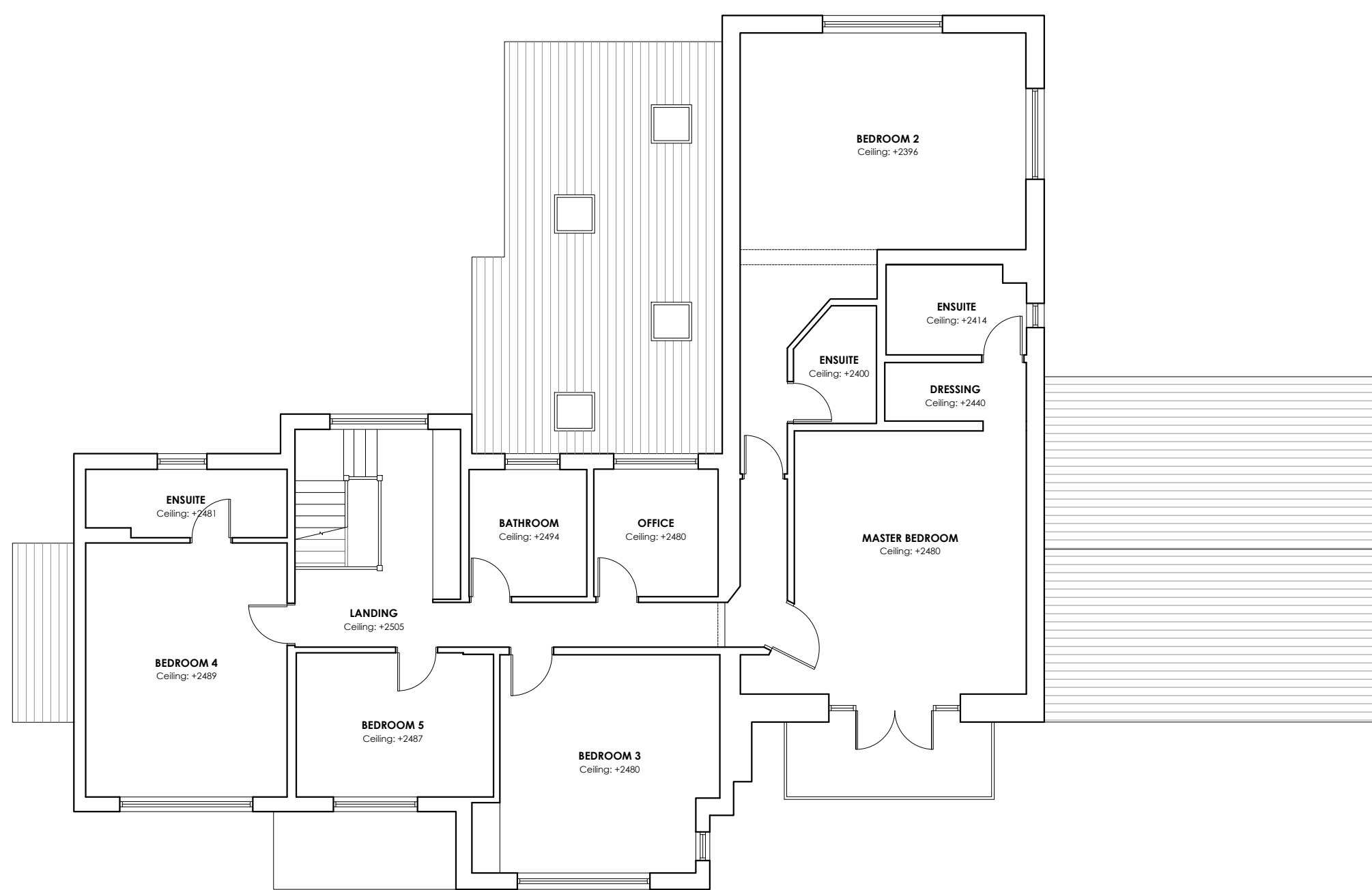
EXISTING FIRST FLOOR PLAN SCALE 1:100