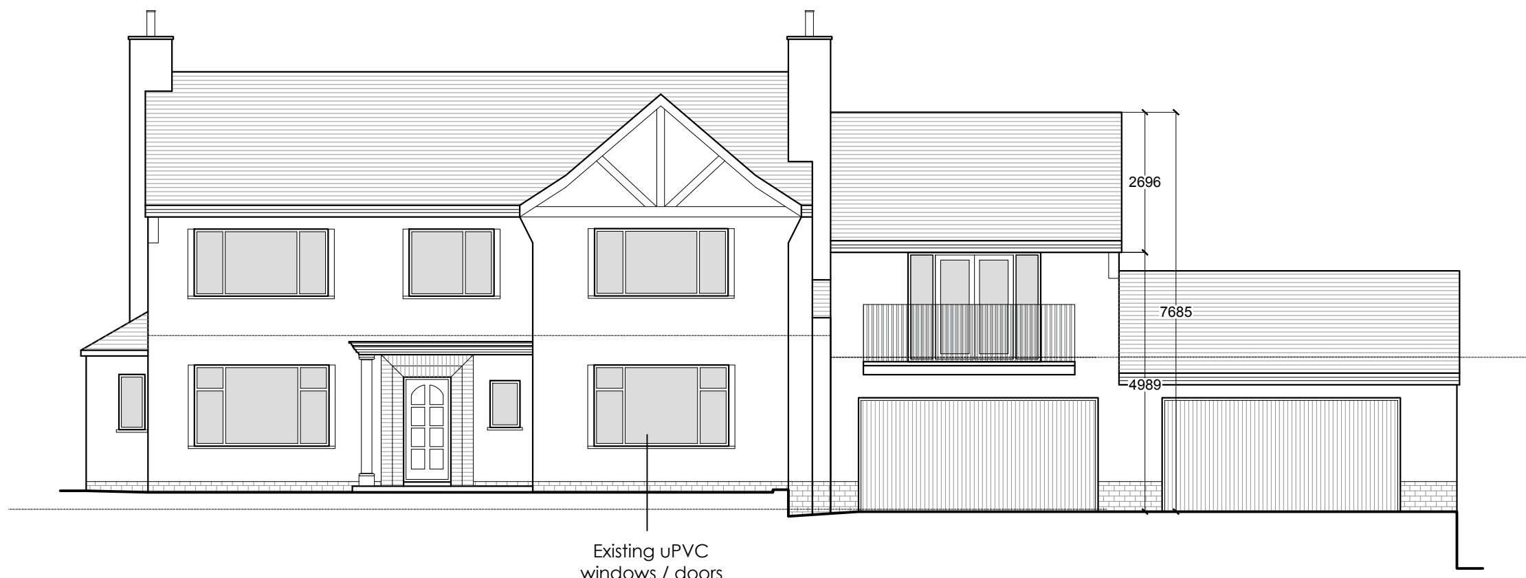
EXISTING SOUTH WEST ELEVATION SCALE 1:100

This drawing is to be read in conjunction with all relevant Architect, consultants' and specialists' drawings and specifications. The Architect is to be notified of any discrepancies before proceeding. Do not scale from this drawing. All dimensions and levels are to be checked on site. This drawing is subject to copyright. All work carried out before Planning and Building Permission has been granted is at the contractor's risk.