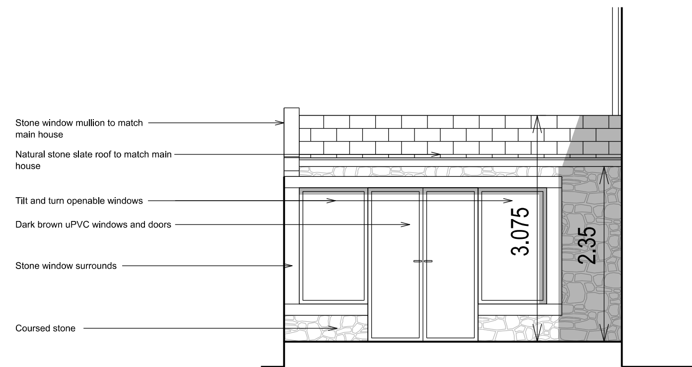
Proposed Side Elevation (South-West) Scale 1:50