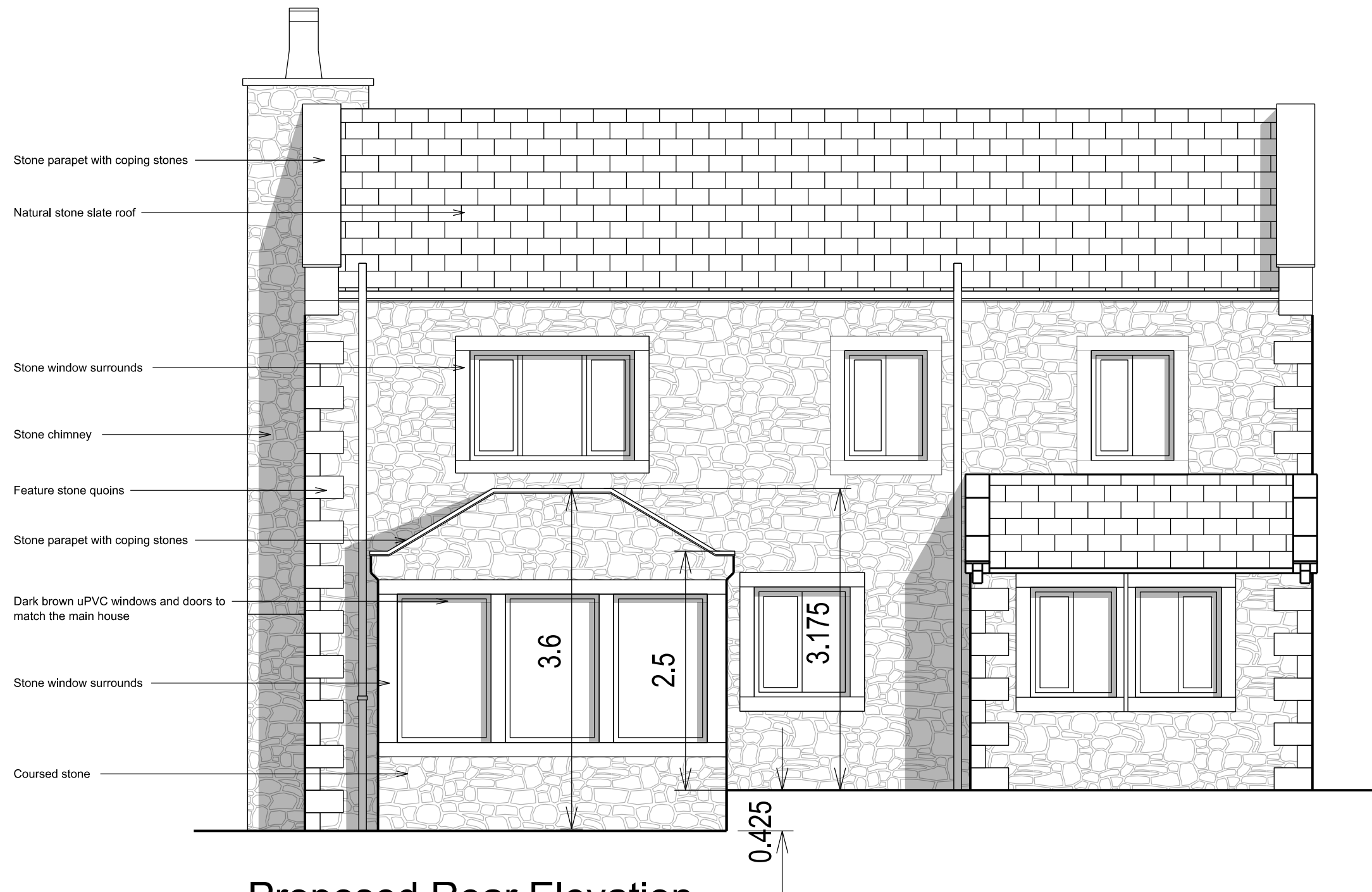
Proposed Rear Elevation Scale 1:50