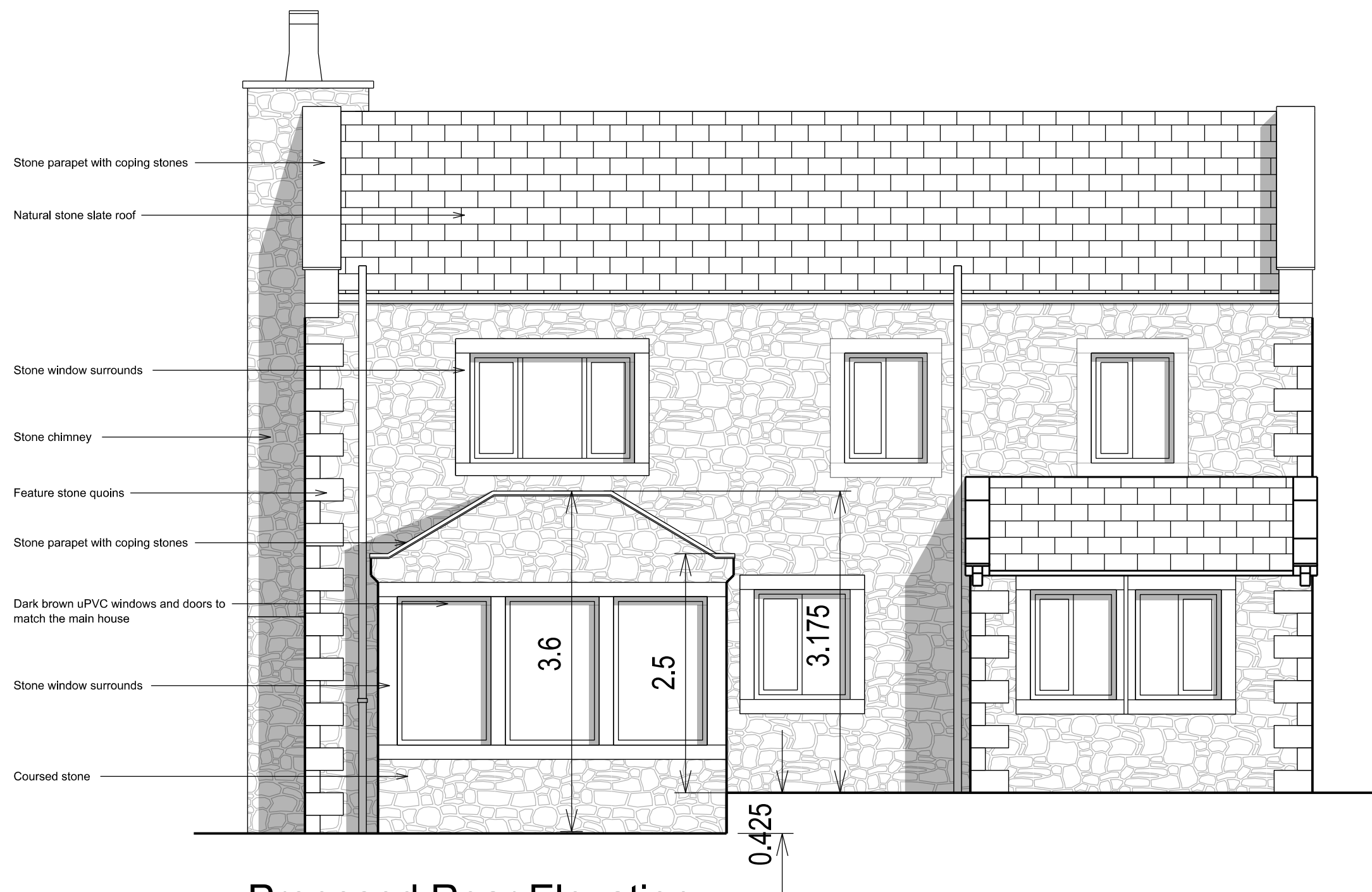
Proposed Rear Elevation Scale 1:50