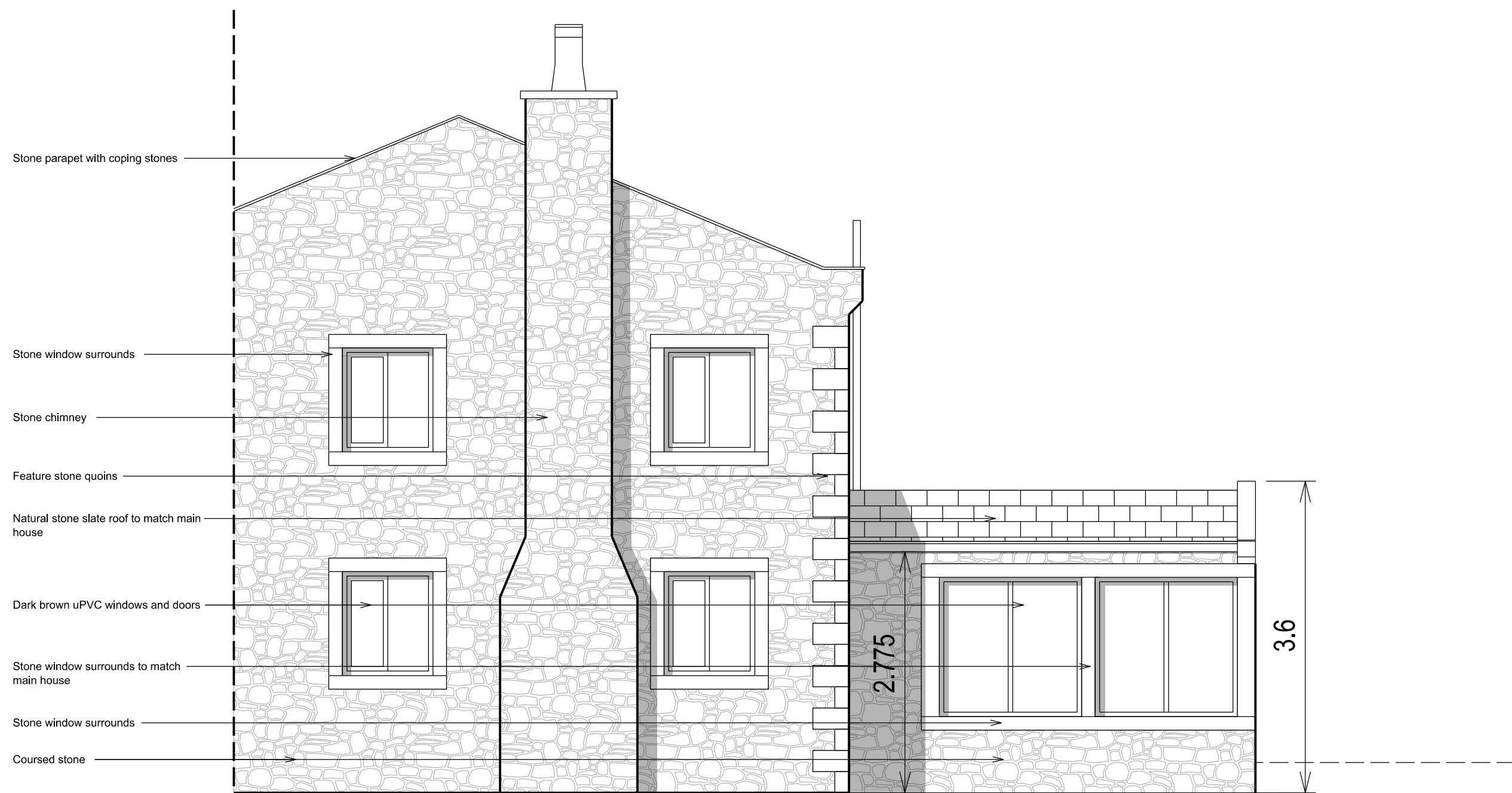
Proposed Side Elevation Scale 1:50