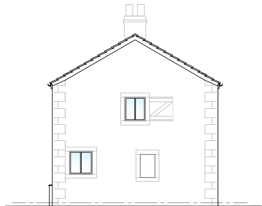
EXISTING END ELEVATION.