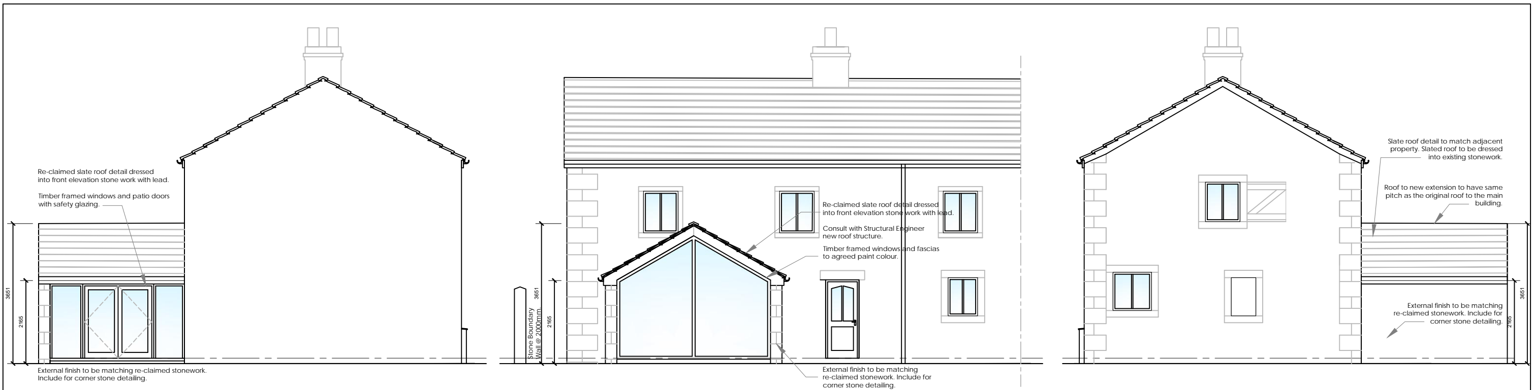
SKETCH END ELEVATION OPTION 01.