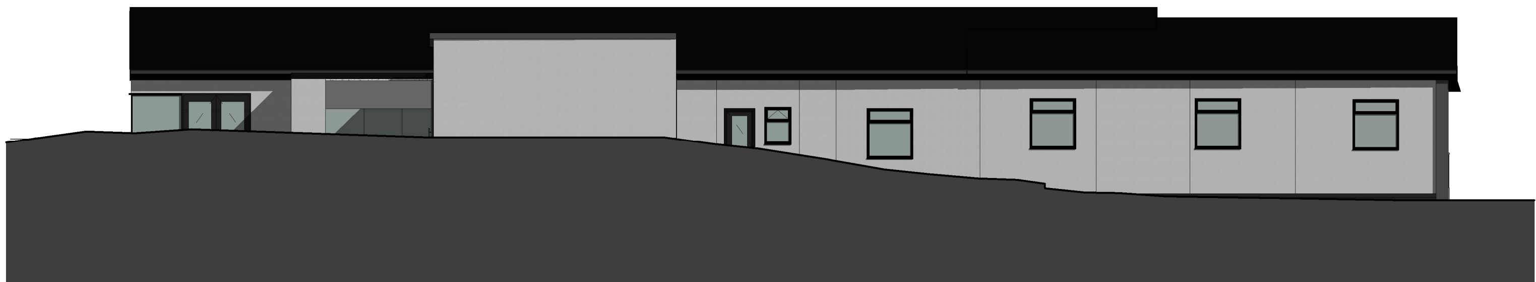
4 South Elevation 1 : 100