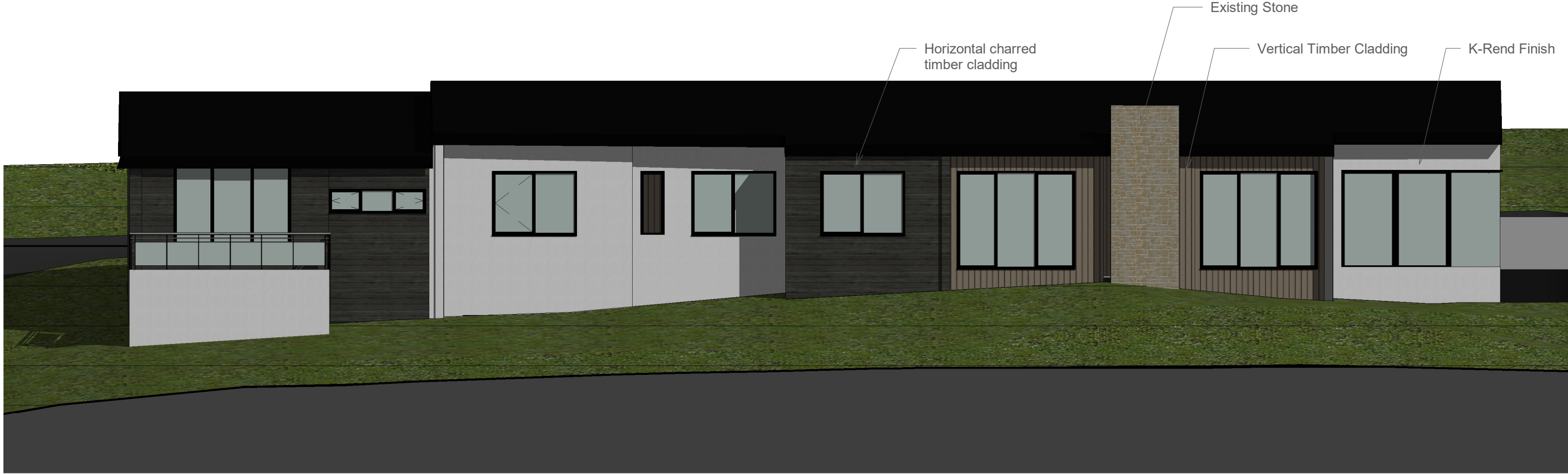
1 North Elevation 1 : 100