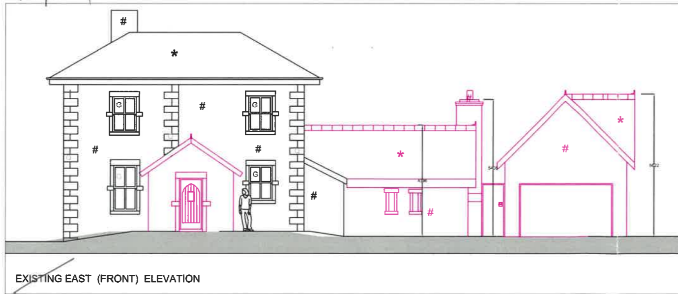
EXISTING EAST (FRONT) ELEVATION