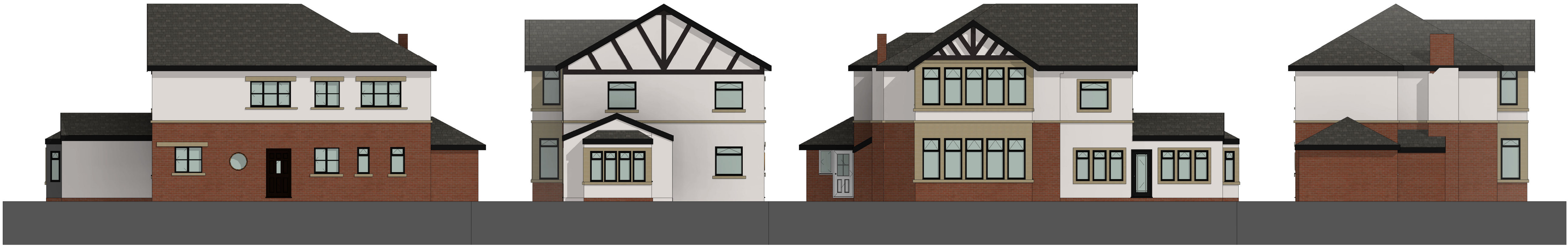
1 Existing Front 1 : 100 2 Existing Side (extension) 1 : 100 3 Existing Rear 1 : 100 4 Existing Side 1 : 100