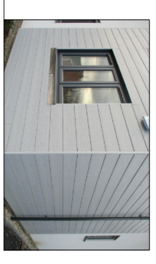
Proposed - Central Click Type Fibre Effect Cladding above colour TBC

Materials Windows - Existing brickwork up to projecting brick detail at ground floor level, to match existing, with Central Click Type Fibre cement, horizontal weatherboard effect cladding above, colour TBC by client. Roof - Interlocking profile concrete tiles to match existing. Rainwater goods - Black uPVC half-round gutters and round RWPs, to match existing. Windows and doors - Grey / White uPVC, double glazed units. Blinding patio doors to be powder coated, aluminium framed, double glazed system, by specialist. Velux, or similar roof windows to be installed.