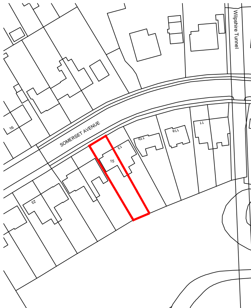
SITE LOCATION PLAN. SCALE 1:1250

CLIENT: MR IFTEKHAR ALI PROJECT NO: CAC/2020/012 DATE: 09/03/2020 DWG No. PL02