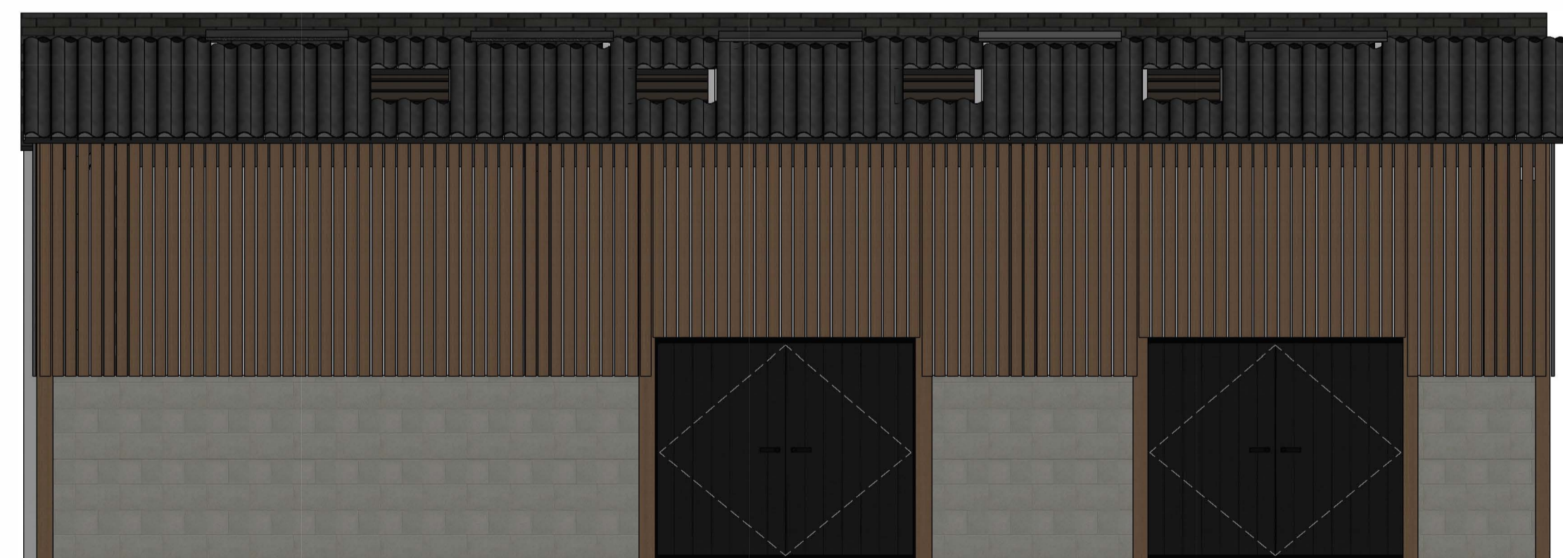
4 North 1 : 50