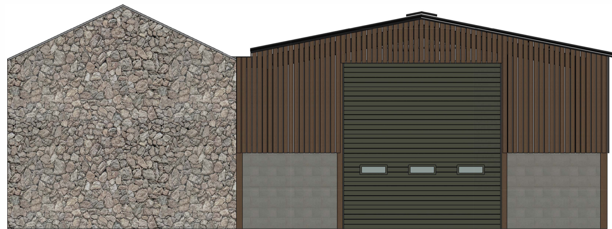
1 East 1 : 50