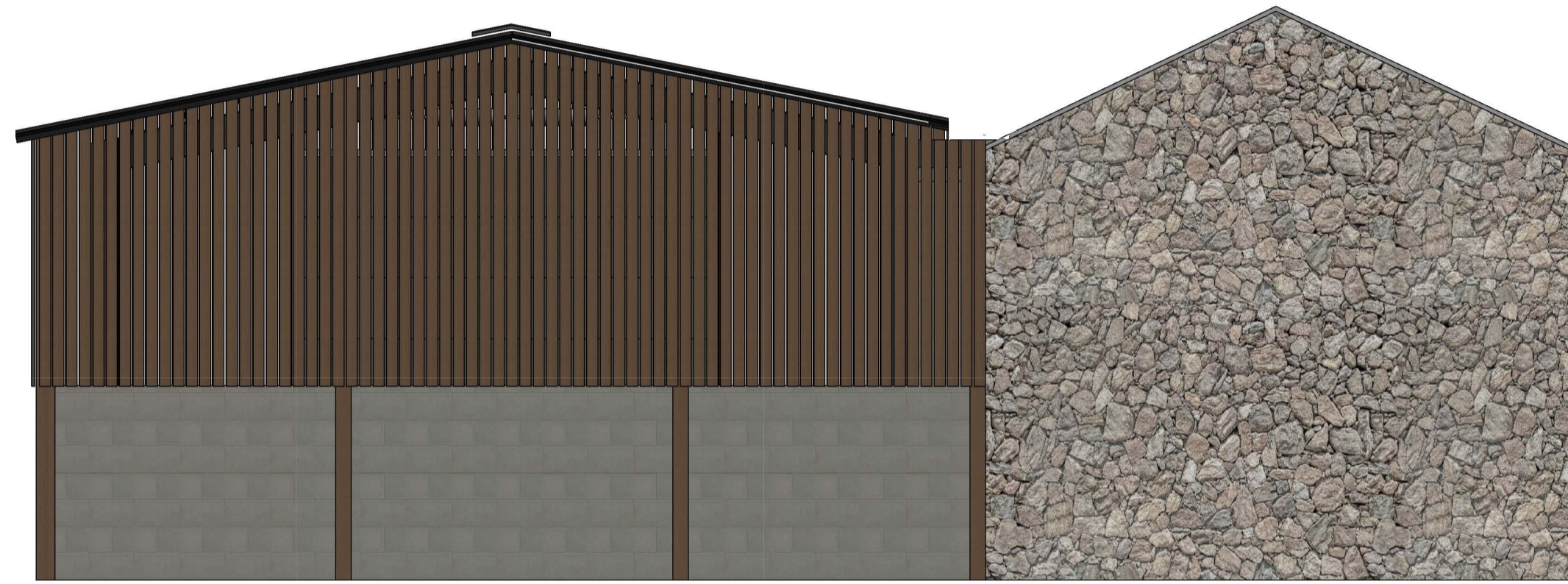
2 West 1 : 50