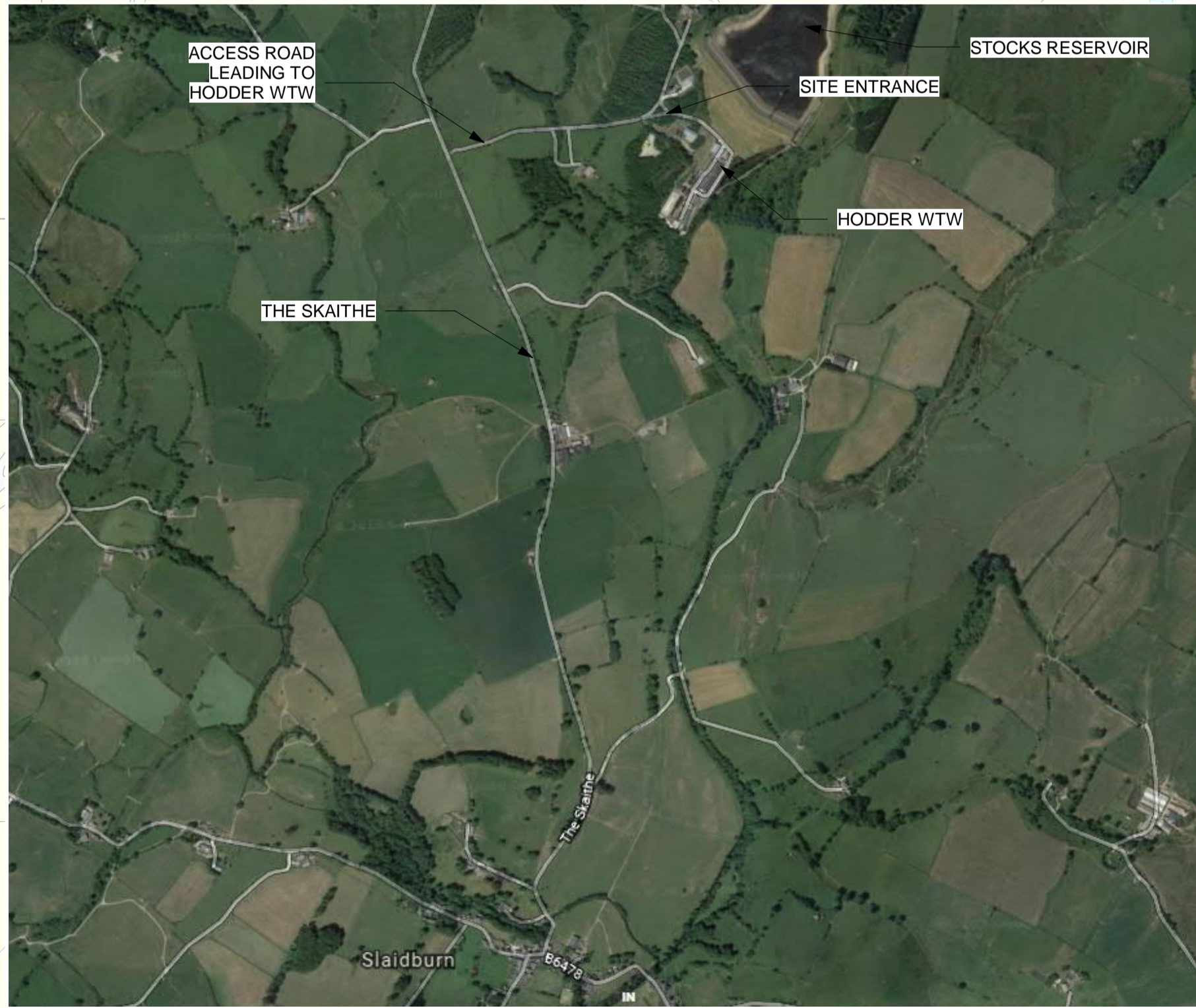
LOCATION PLAN 1 : 2500

UNITED UTILITIES AMP6 FRAMEWORK HODDER WTW LOCATION PLAN