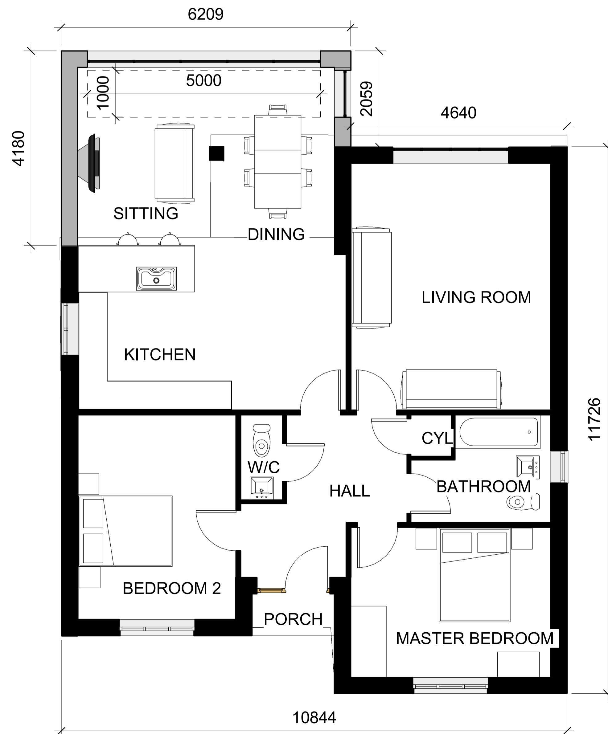
3 0 PROPOSED GROUND FLOOR 1 : 50