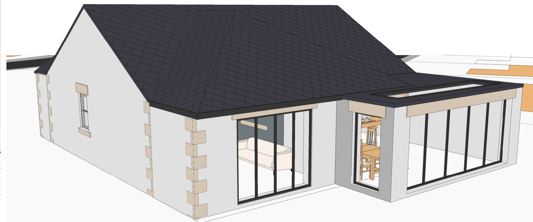
5 3D View.