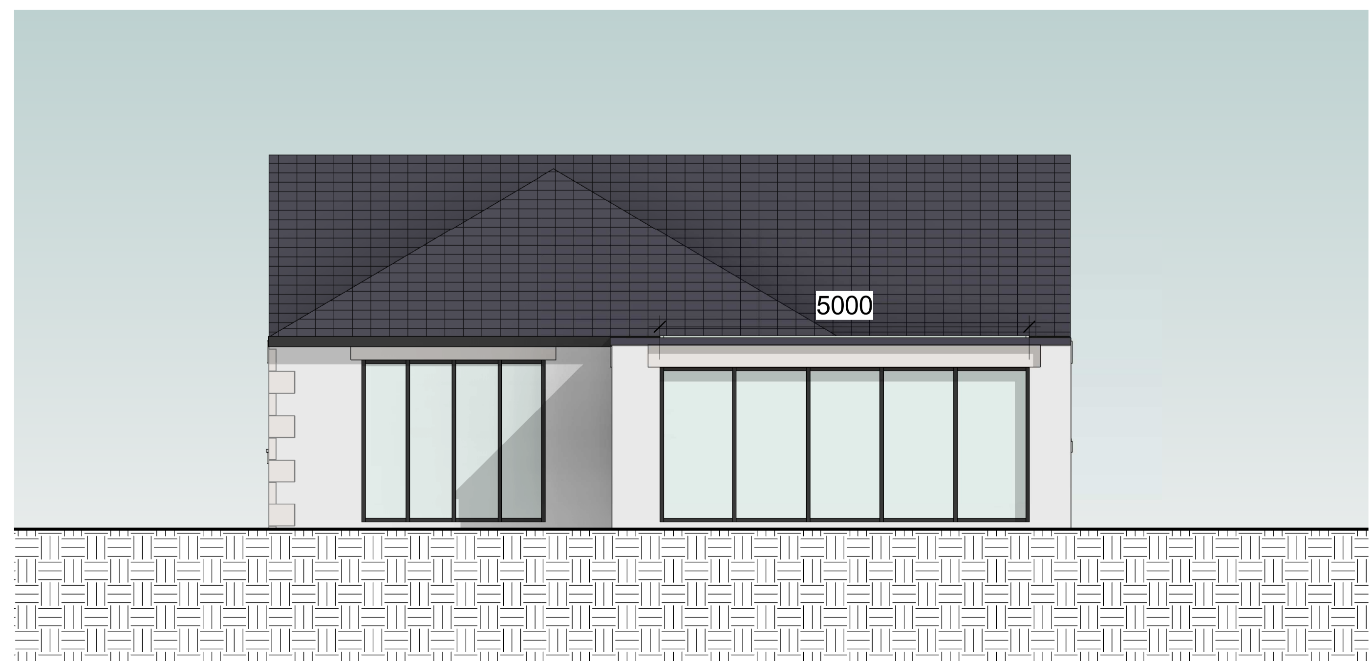
2 PROPOSED NORTH 1 : 50