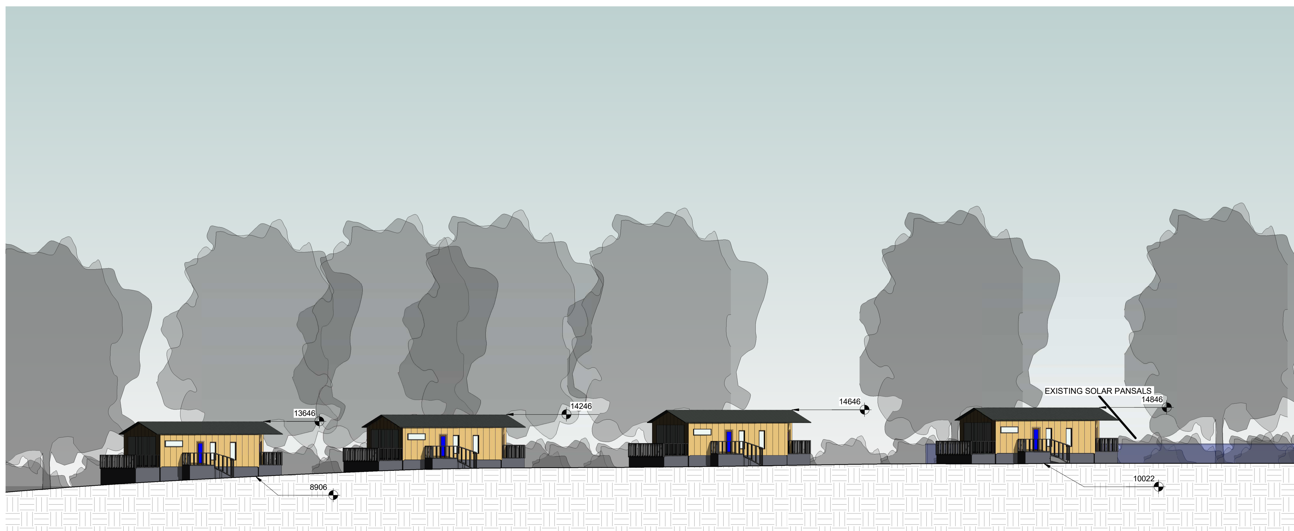
1 PROPOSED SECTION 1 : 200