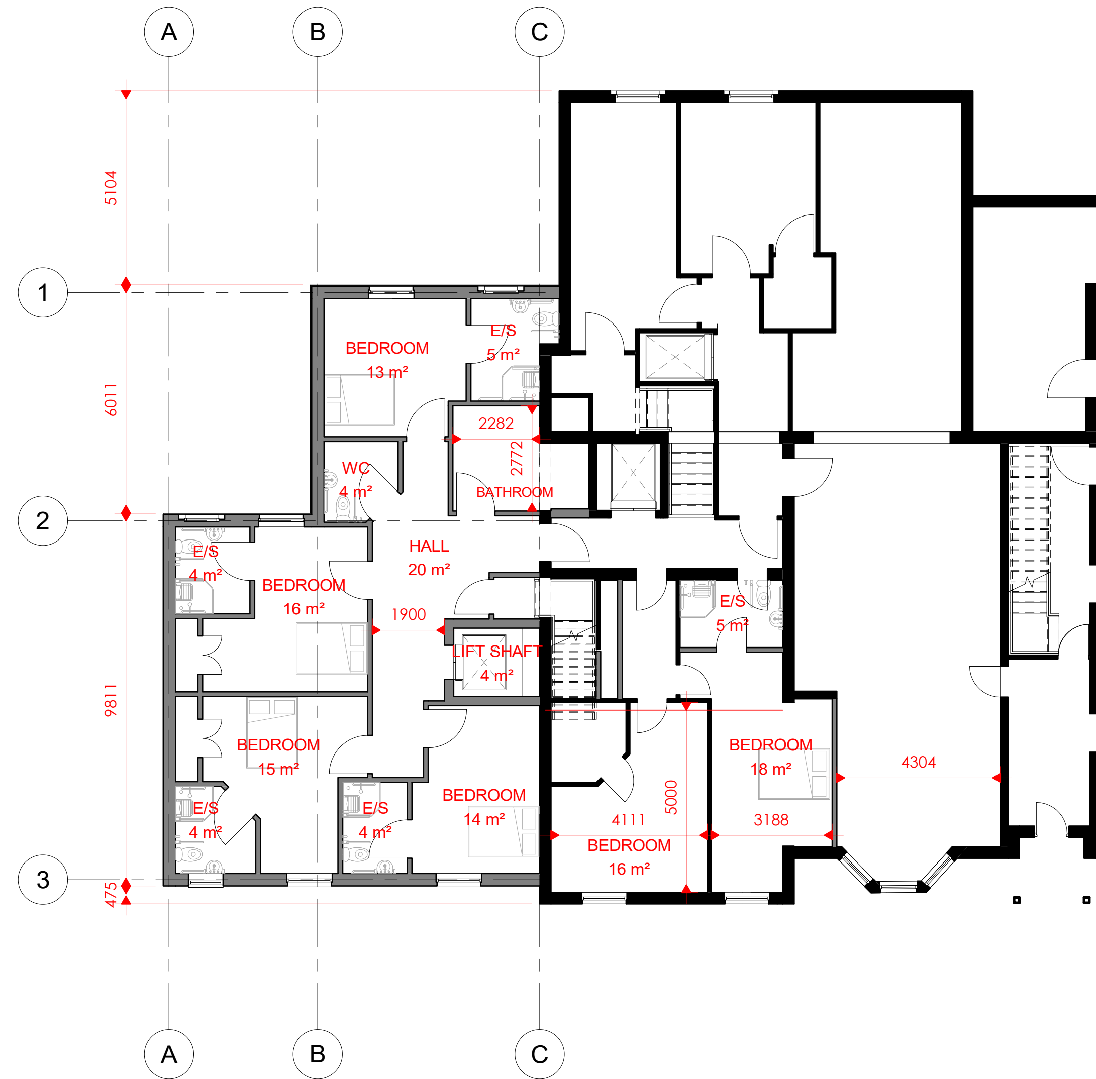
2 PROPOSED GROUND FLOOR - PLANNING 1 : 100