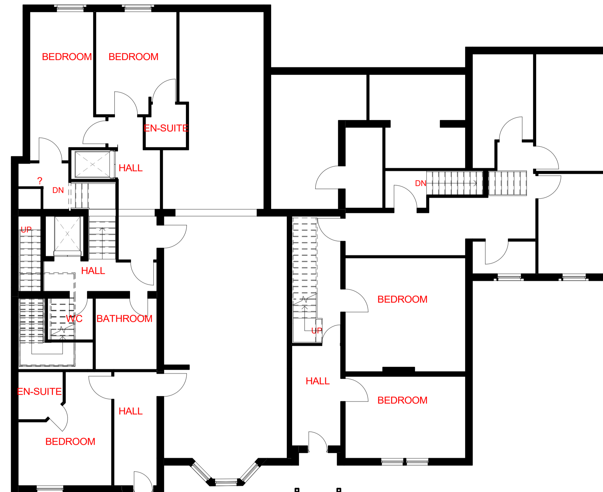
2 0 HBH GROUND FLOOR 1 : 100