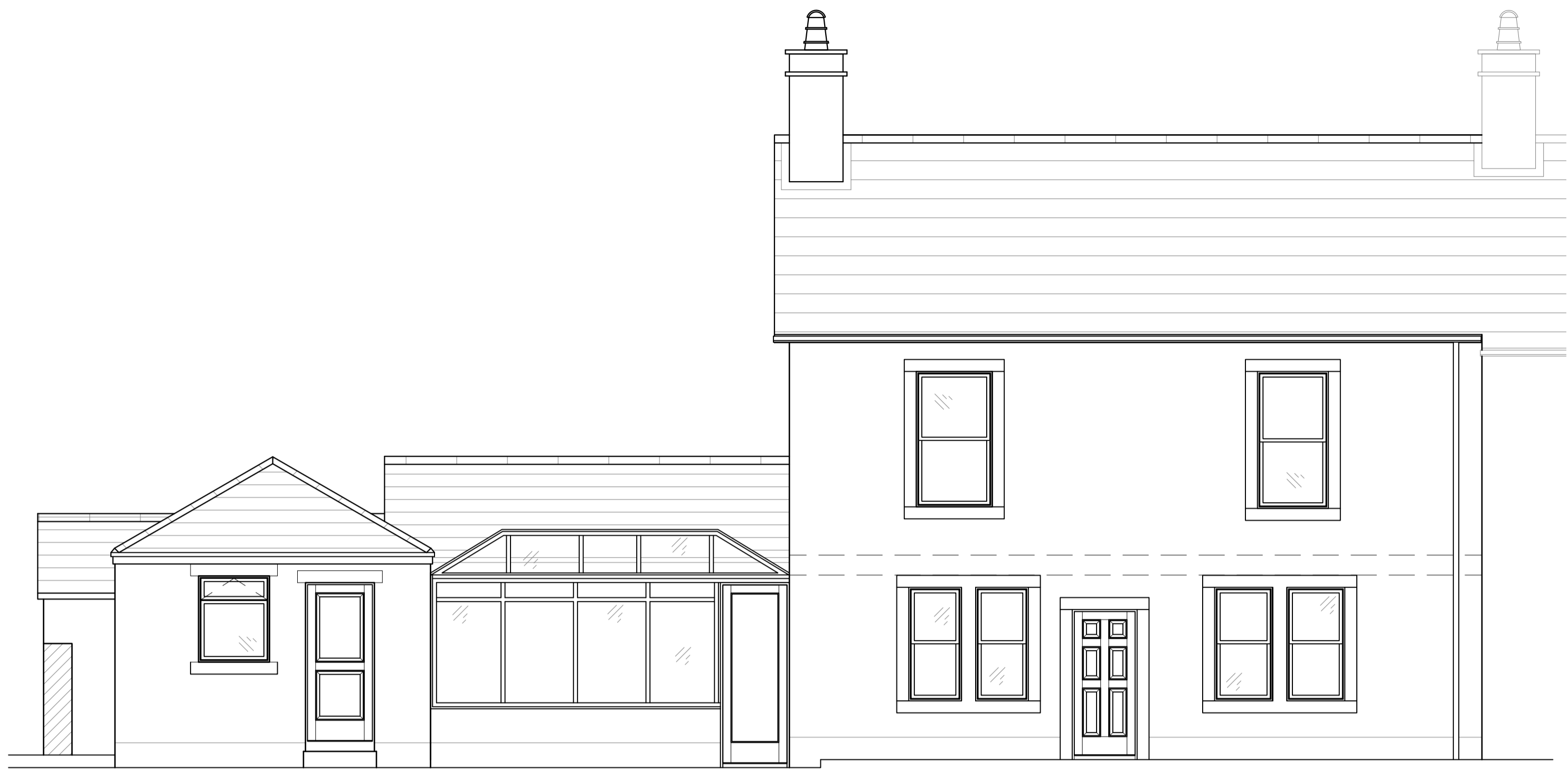
BEECHTHORPE AVENUE ELEVATION