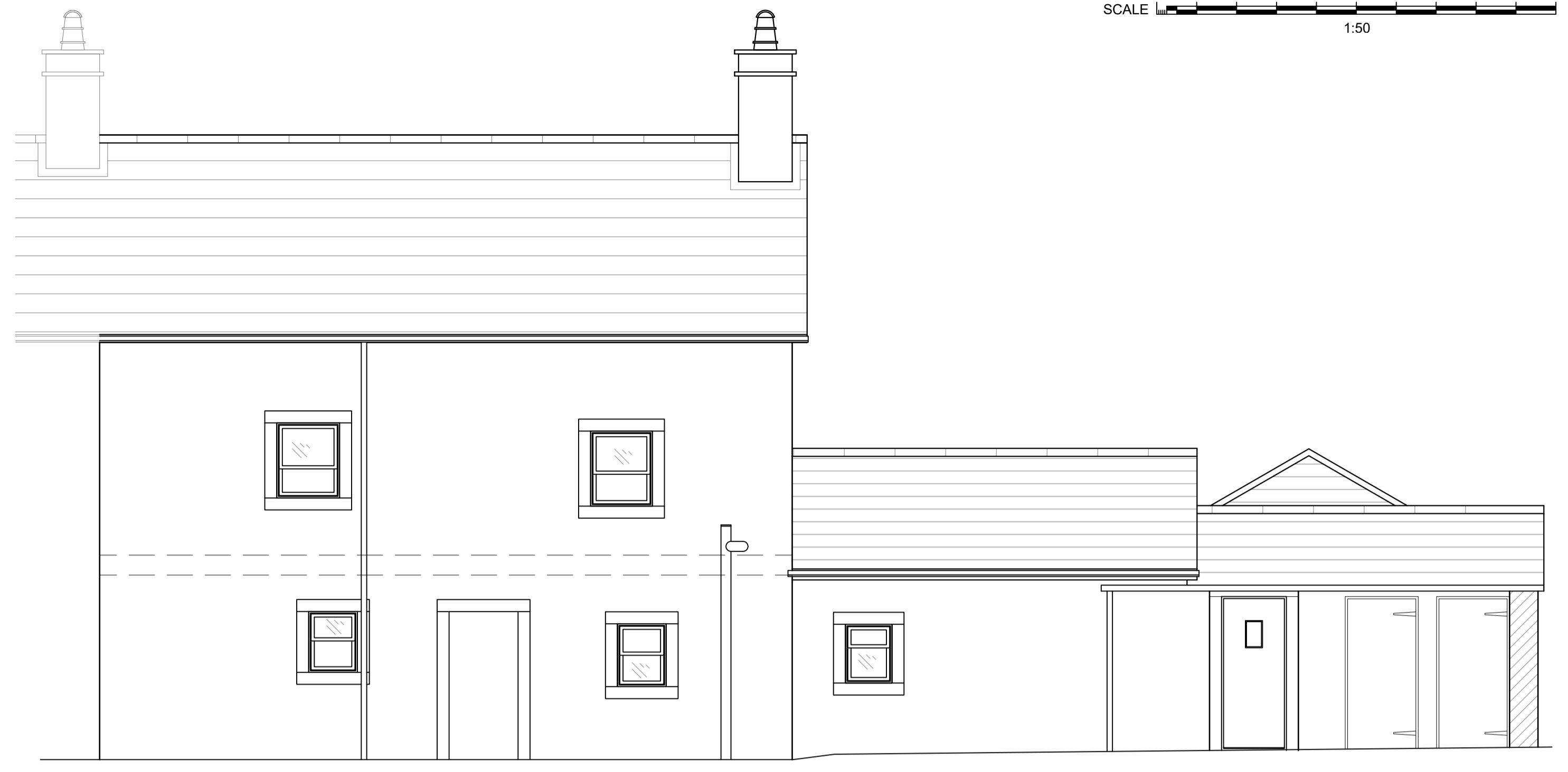
REGENT STREET ELEVATION