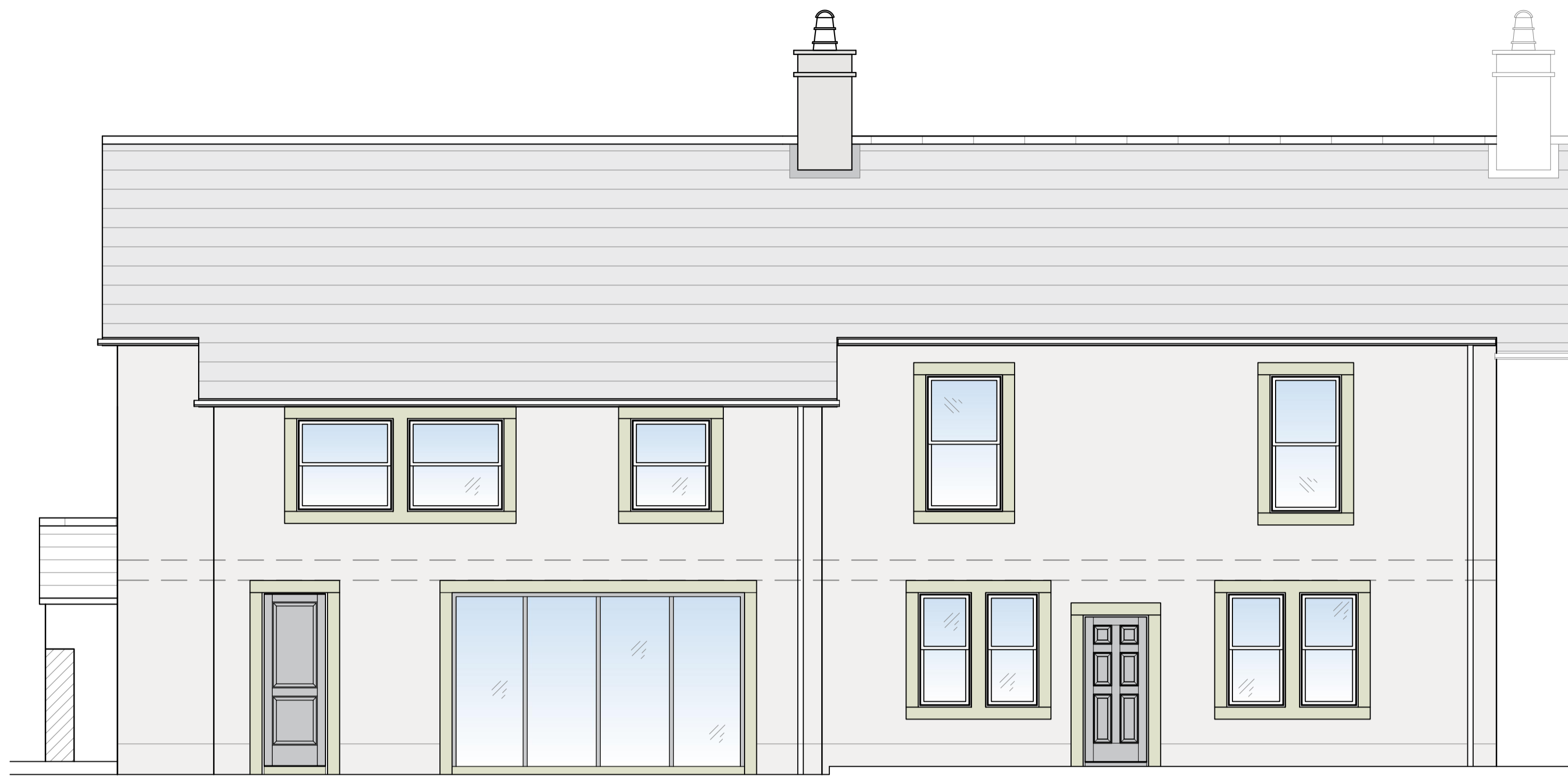
BEECHTHORPE AVENUE ELEVATION