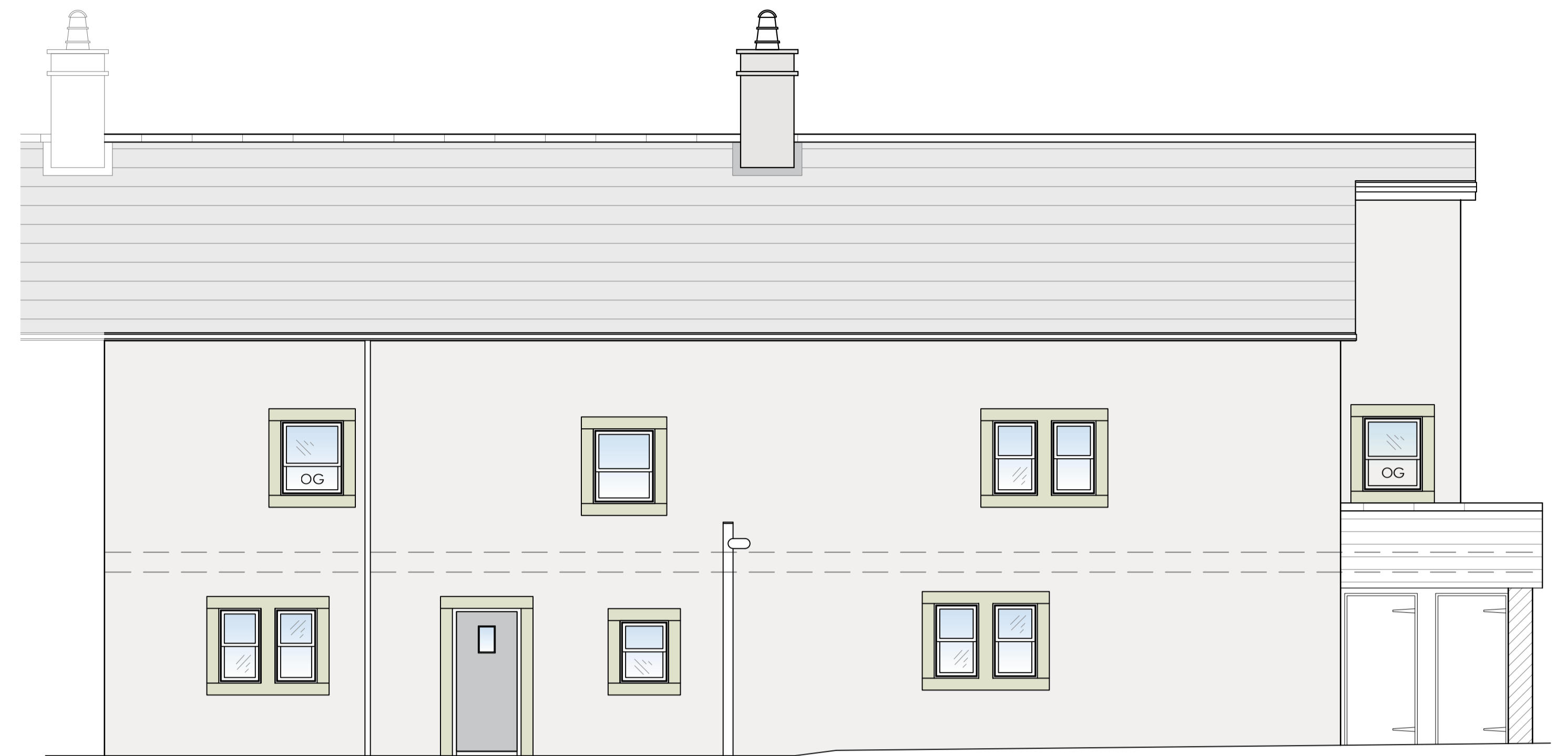
REGENT STREET ELEVATION

OG: Denotes windows fit with obscure glazing