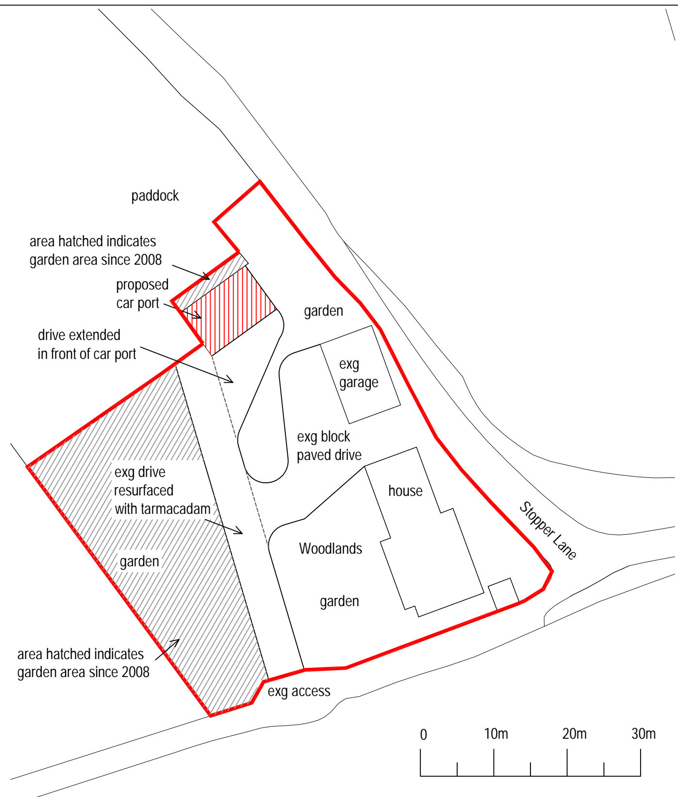
PROPOSED SITE PLAN scale 1:500