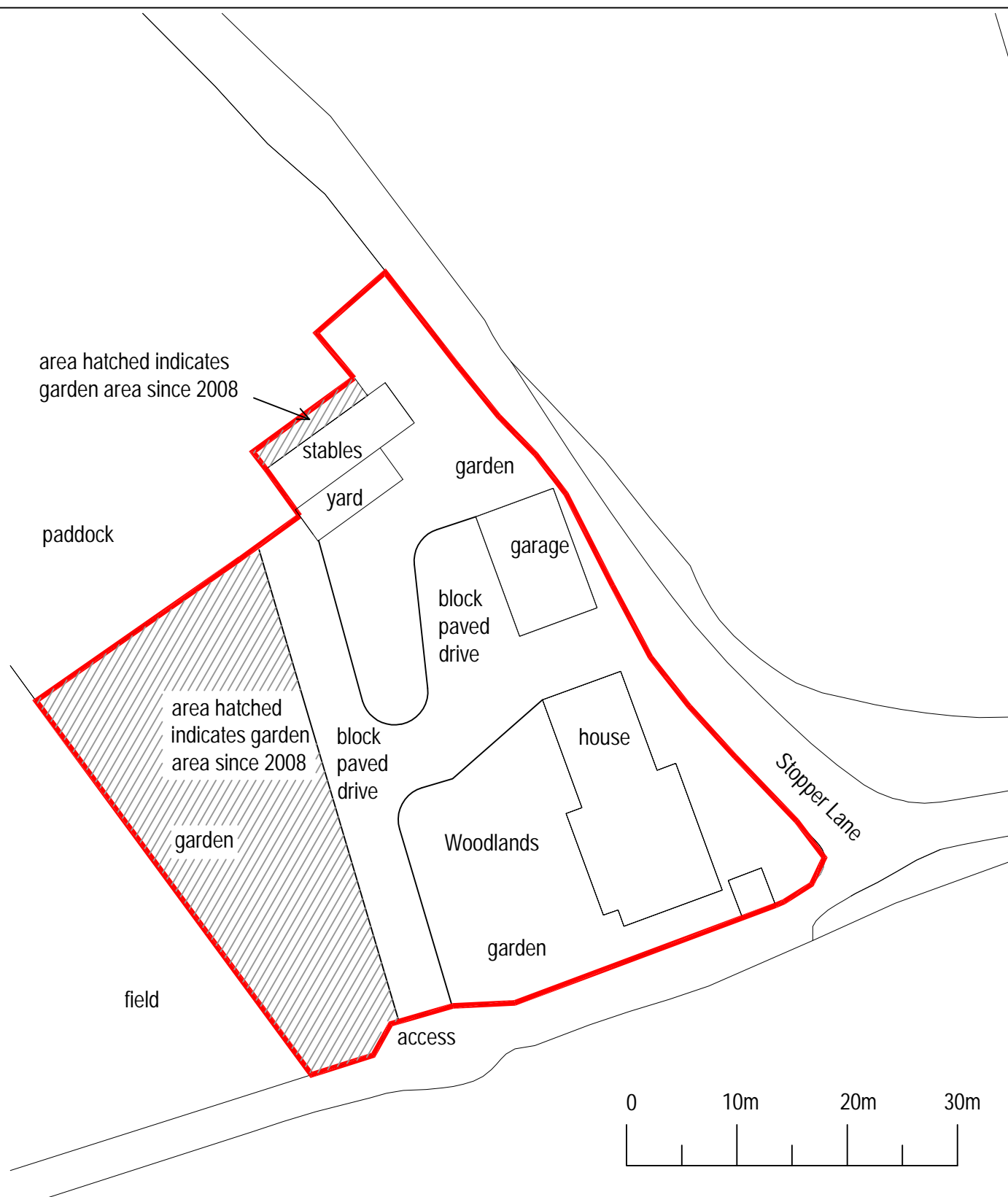
EXISTING SITE PLAN scale 1:500