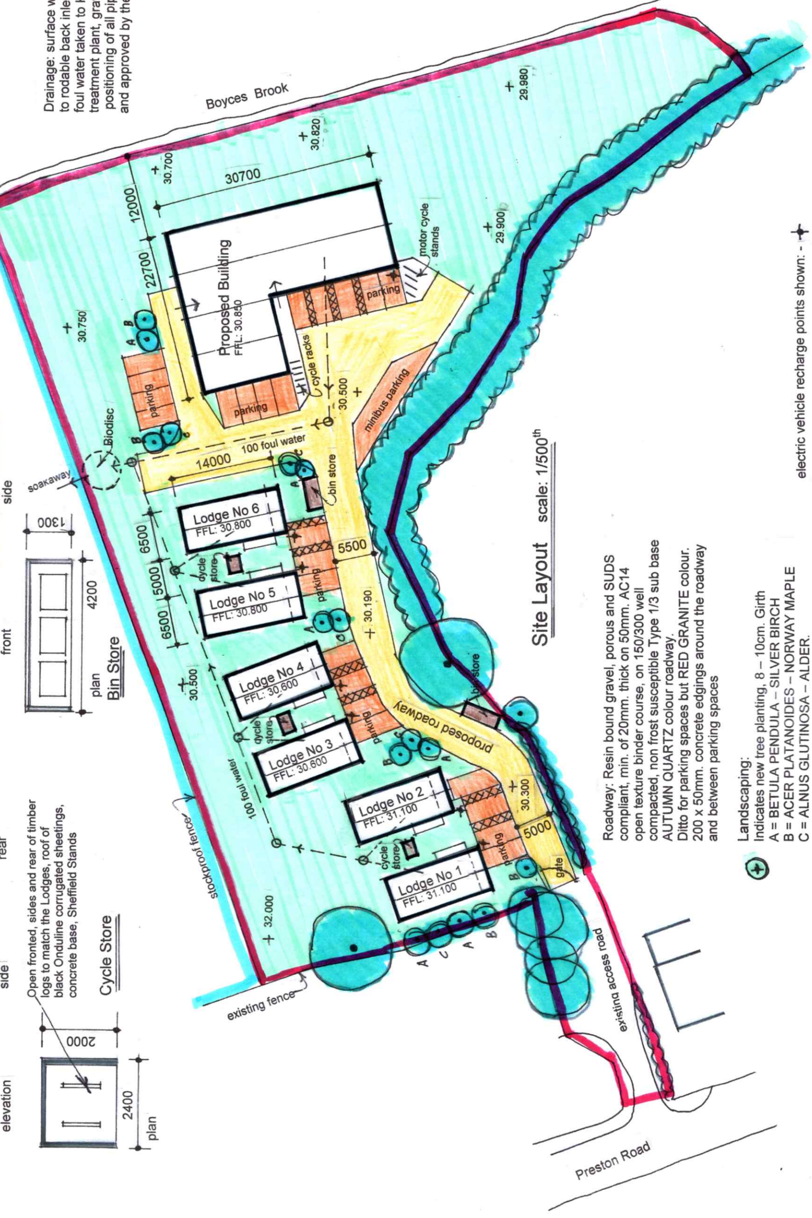
Site Layout scale: 1/500 th