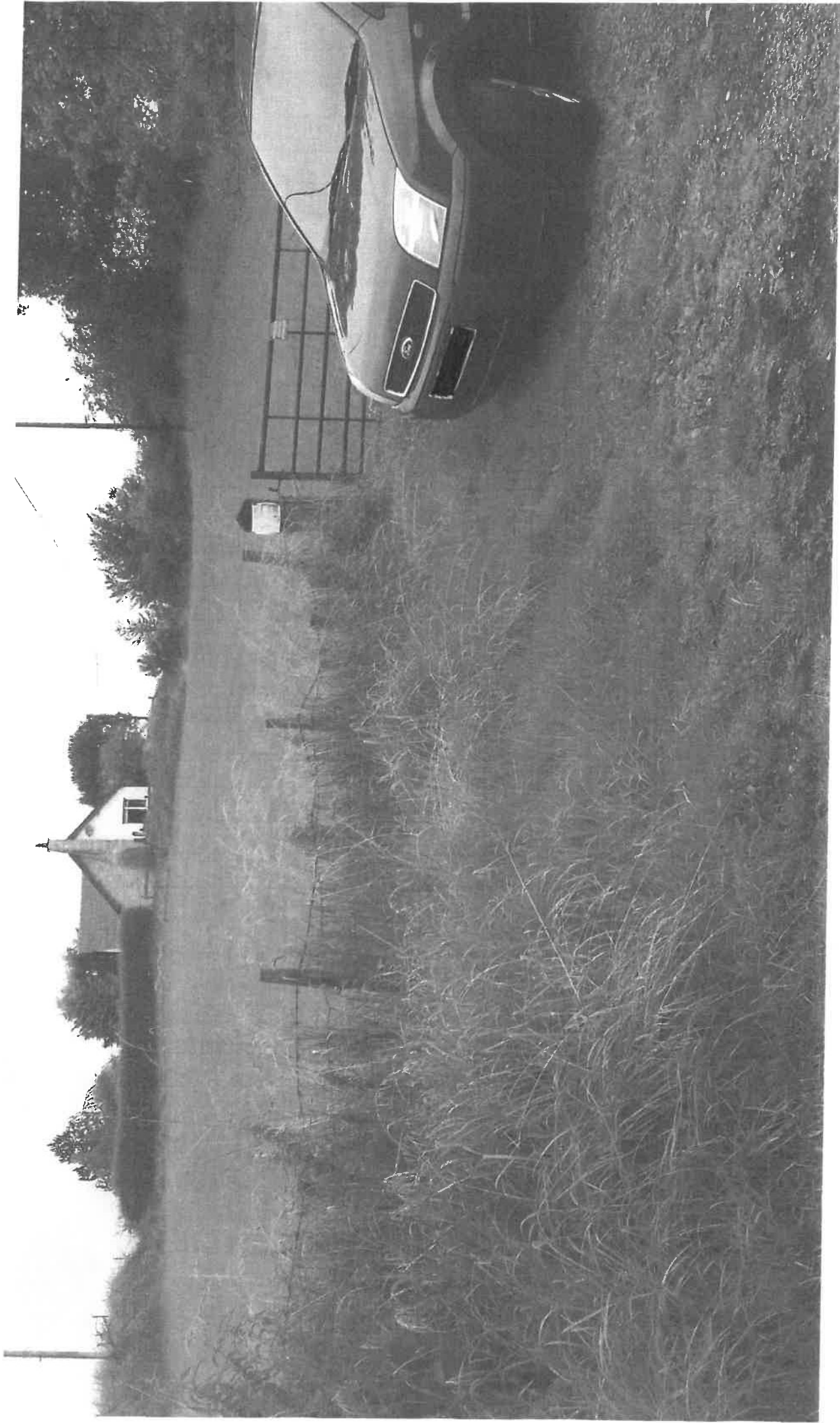
Hand to left hand side of road