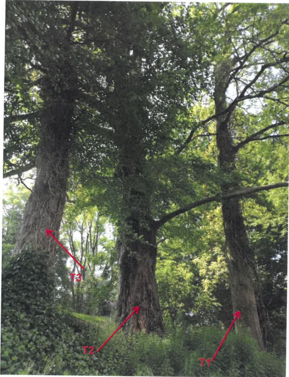
Group in summer with decay visible at ground level to north of T2 – central tree.