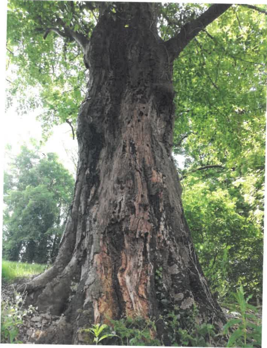
Closer view of decay to base of T2.