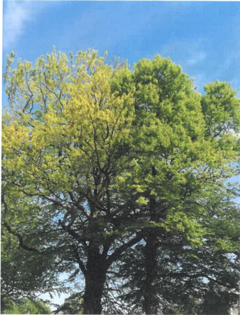
T2 Beech indicating thinning of high crown in summer.