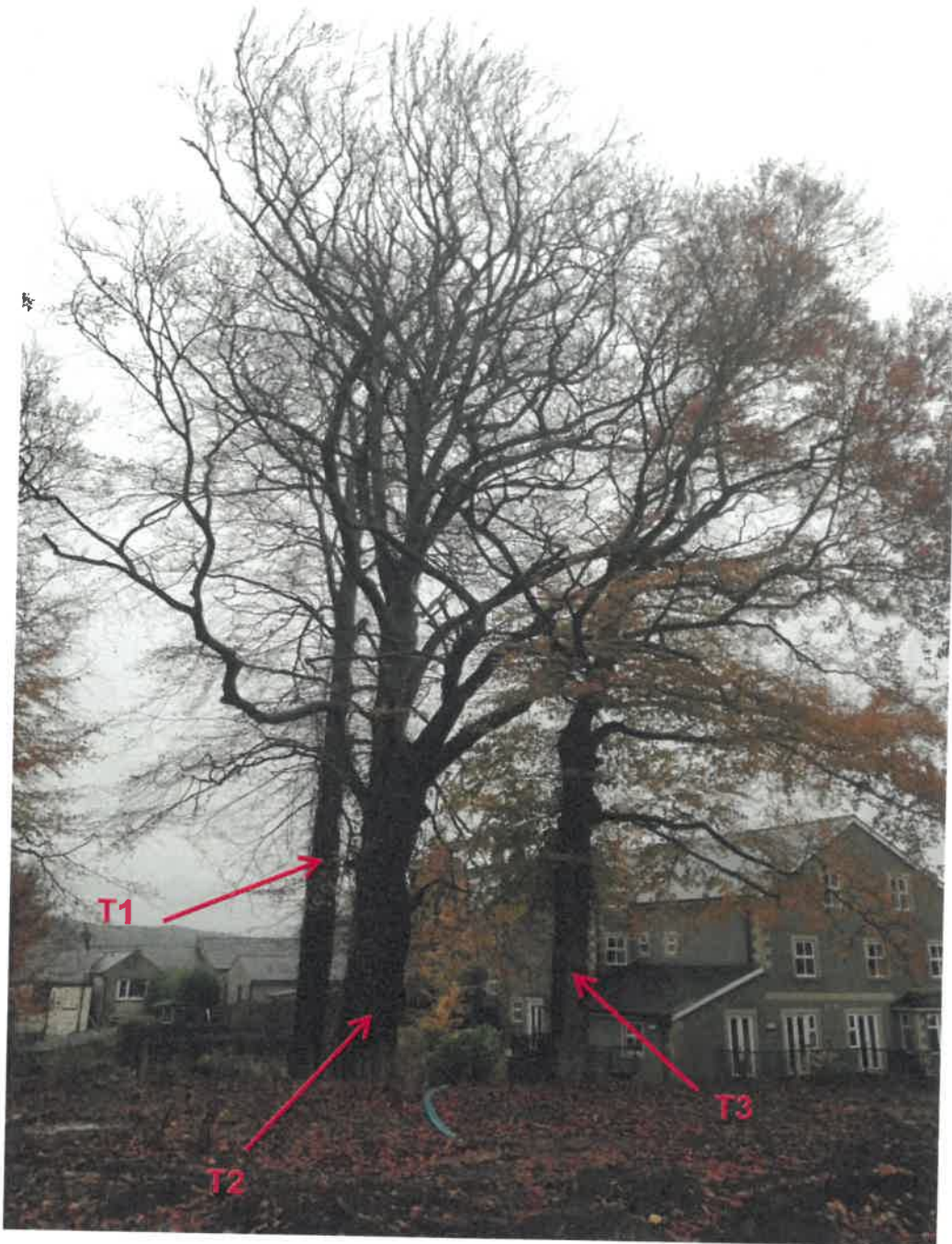
Group in winter, again showing very suppressed form of T3.