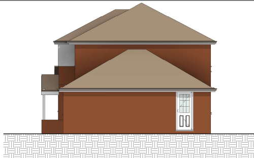
2 PROPOSED EAST. 1 : 50