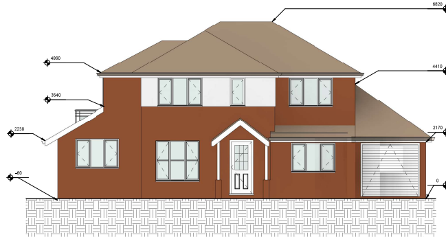
5 PROPOSED SOUTH. 1 : 50