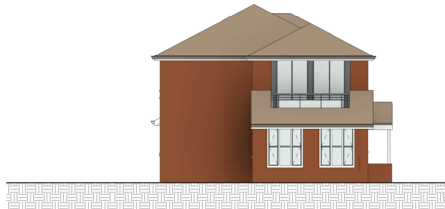
6 PROPOSED WEST. 1 : 50