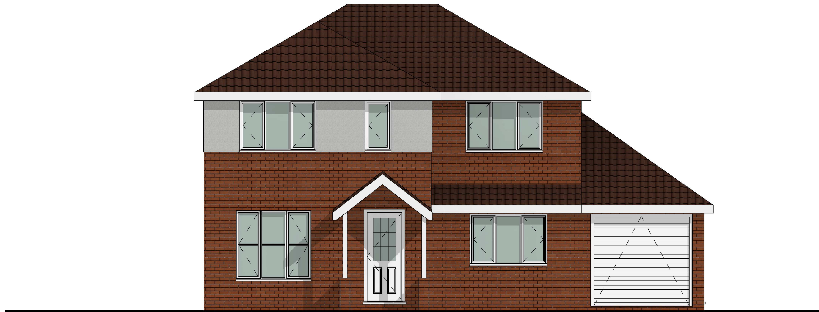
5 EXISTING SOUTH 1 : 50