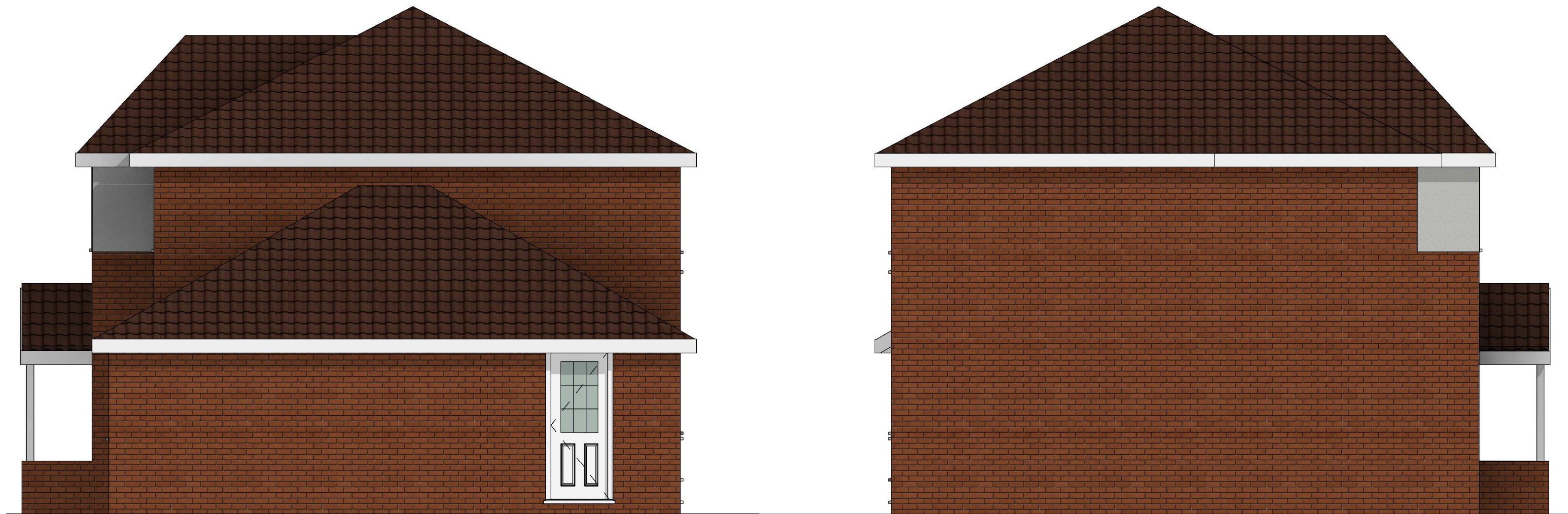
3 EXISTING EAST 1 : 50