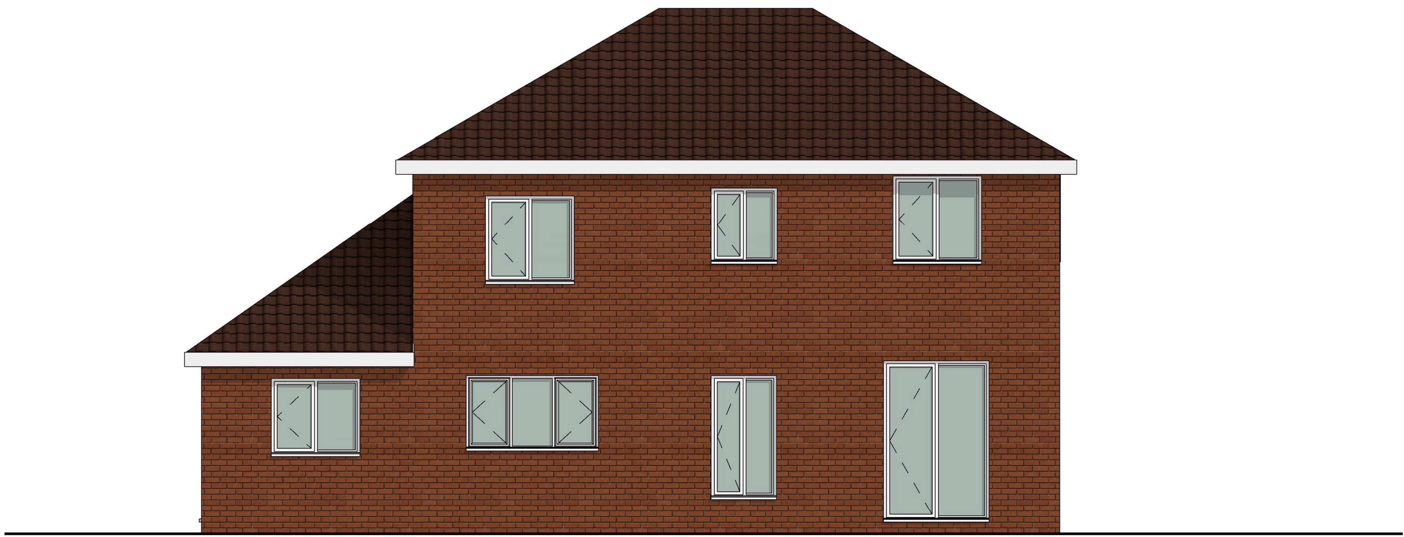
4 EXISTING NORTH 1 : 50