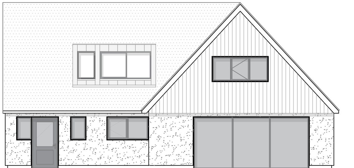
PROPOSED SOUTHERN ELEVATION