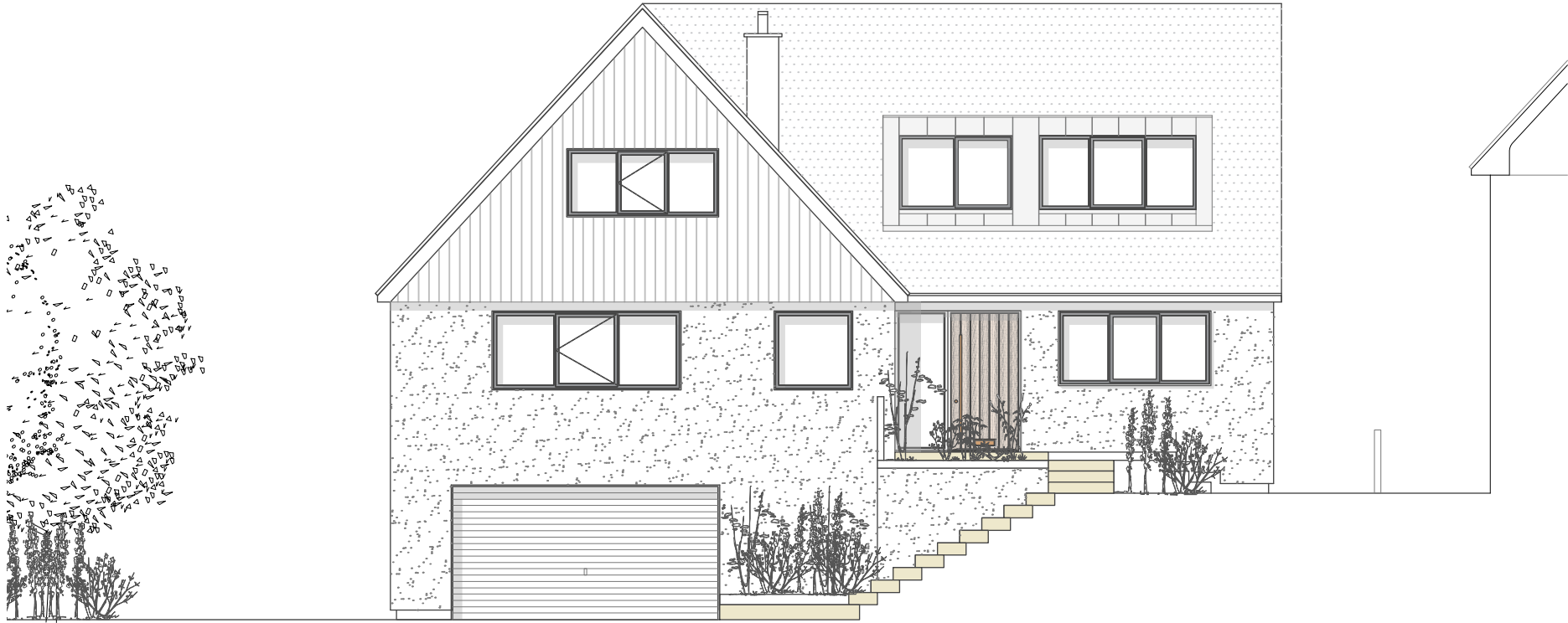
PROPOSED NORTHERN ELEVATION