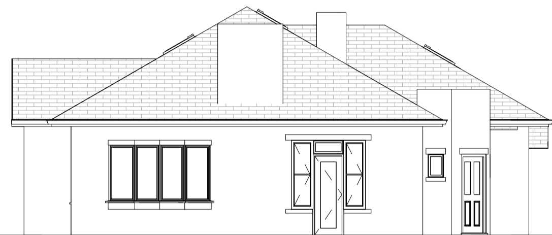
3 EXISTING SOUTH EAST 1 : 100