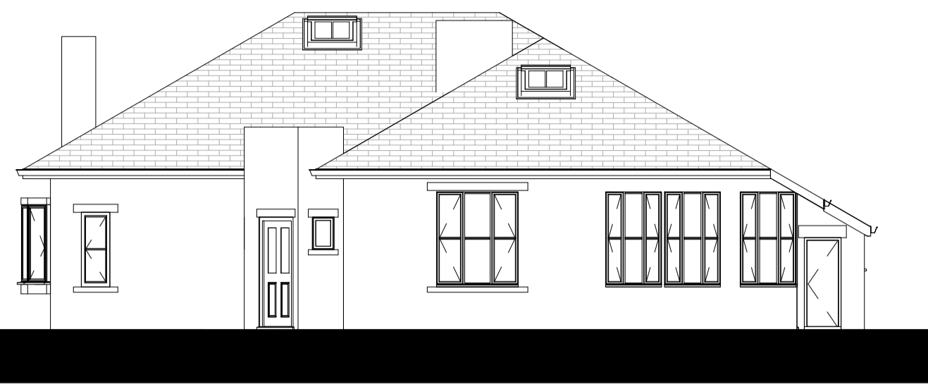
1 EXISTING NORTH EAST 1 : 100