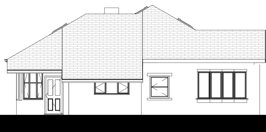
2 EXISTING NORTH WEST 1 : 100