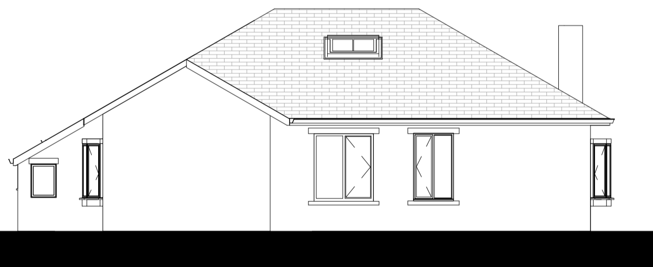
4 EXISTING SOUTH WEST 1 : 100