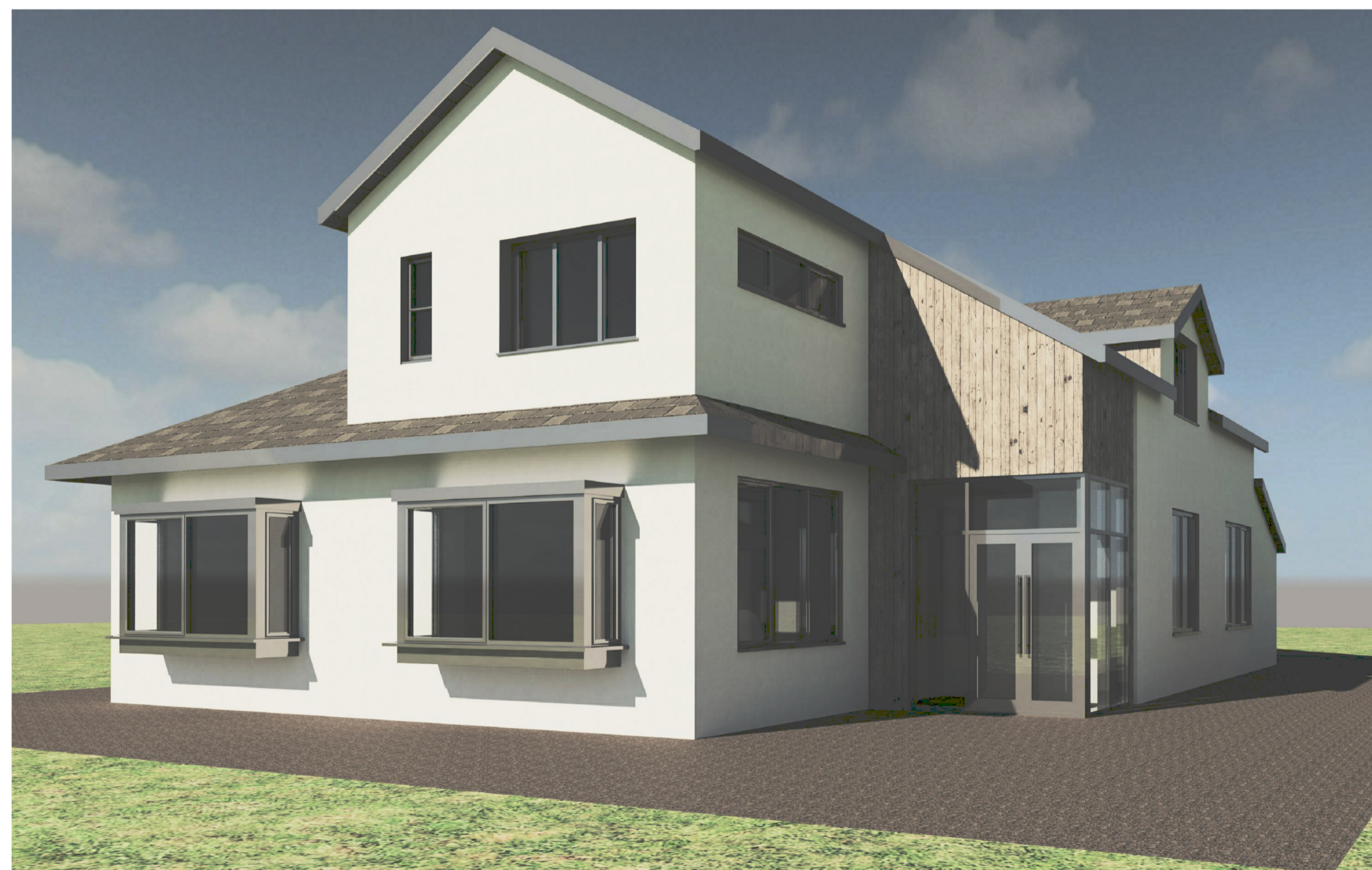
PROPOSED FRONT PERSPECTIVE