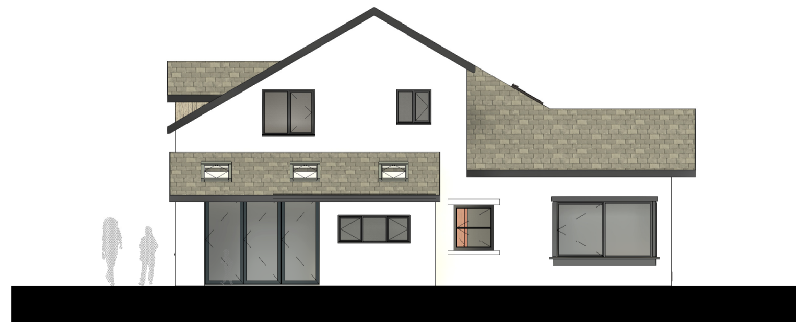
5 PROPOSED NORTH WEST 1 : 100