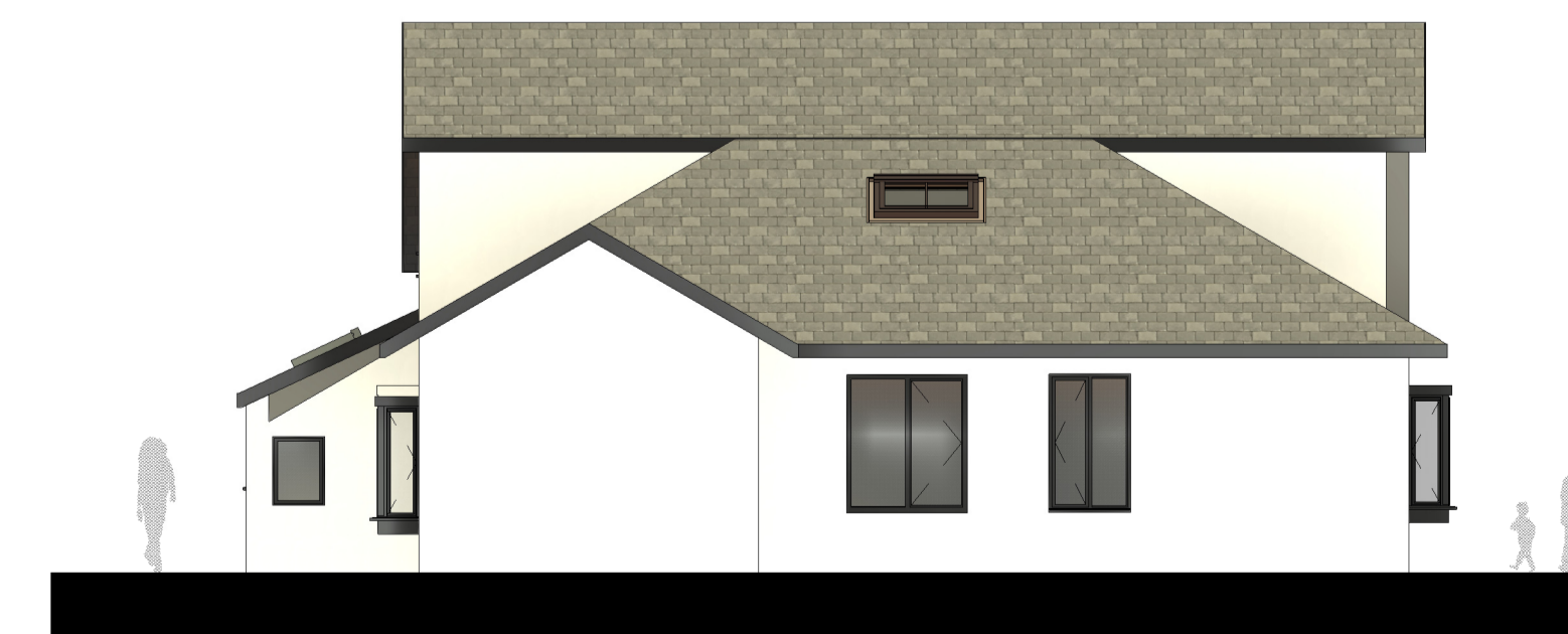
6 PROPOSED SOUTH WEST 1 : 100