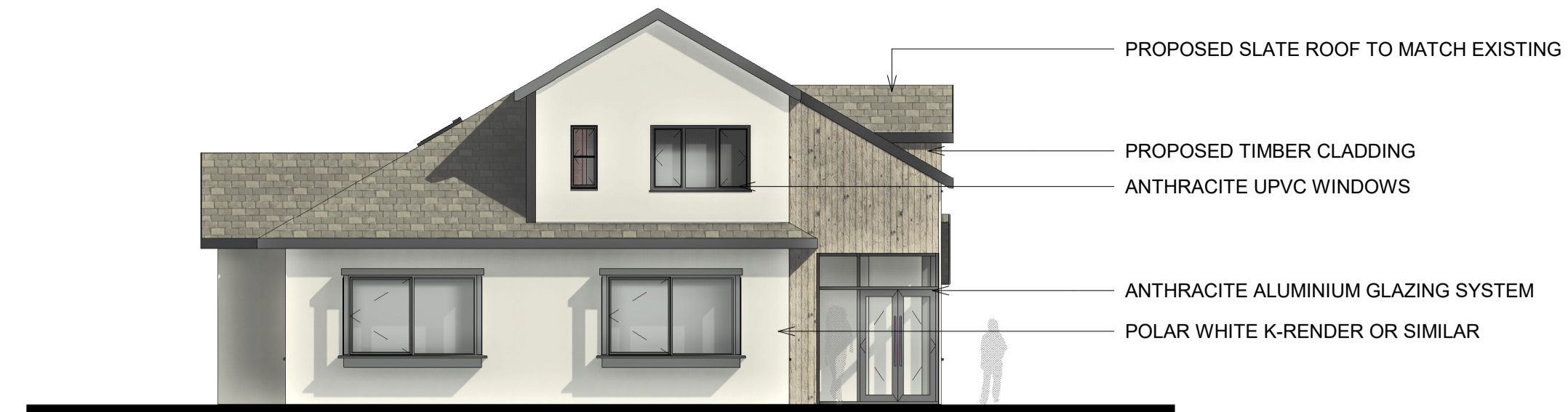
3 PROPOSED SOUTH EAST 1 : 100