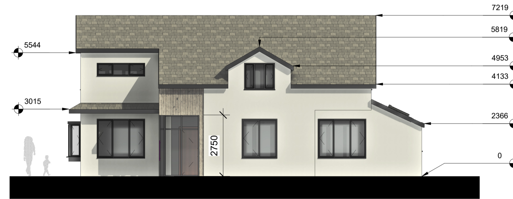
4 PROPOSED NORTH EAST 1 : 100