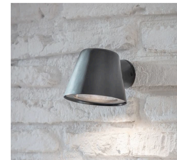
Wall mounted down light Max 6.5w LED